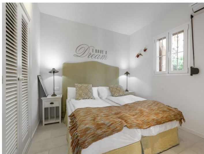
Second double bedroom