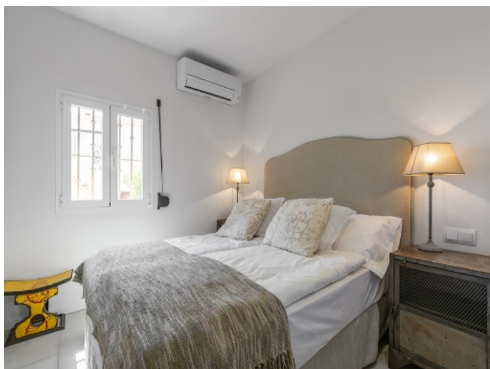
First double bedroom