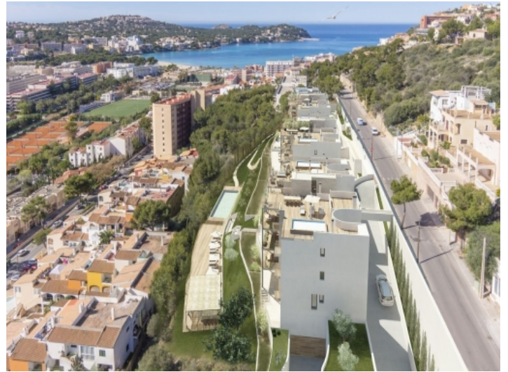
Fantastic sea views