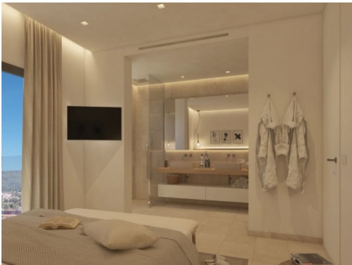
Master bedroom with bathroom en suite