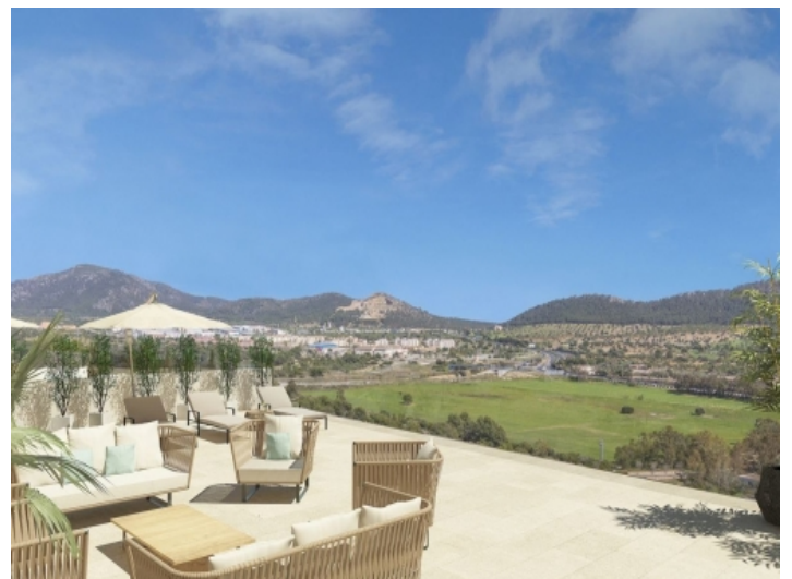
Terrace with a view