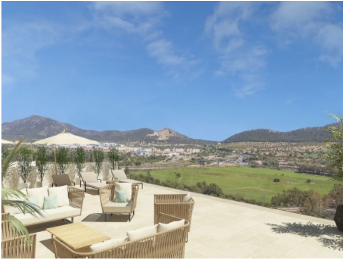
Terrace with a view