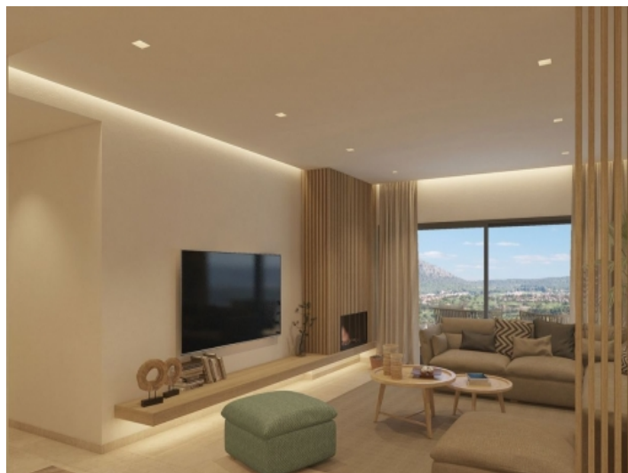
Open living area with large windows