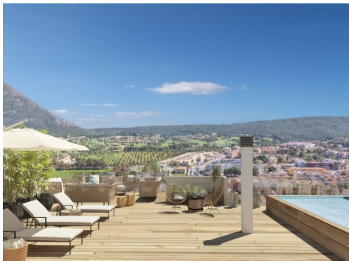
Sun loungers at the pool area