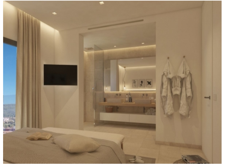
Master bedroom with bathroom en suite