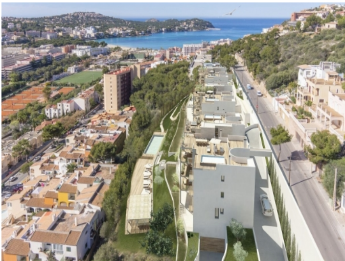
Fantastic sea views