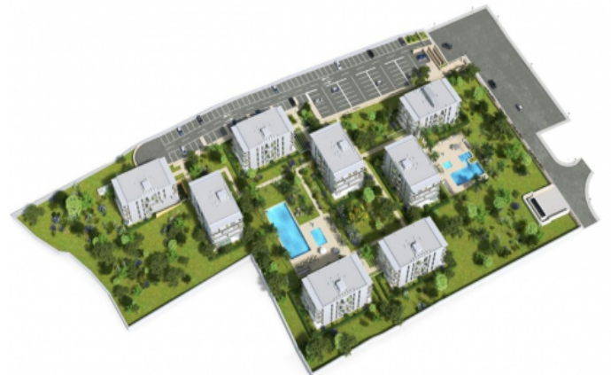
Overview of the residential complex