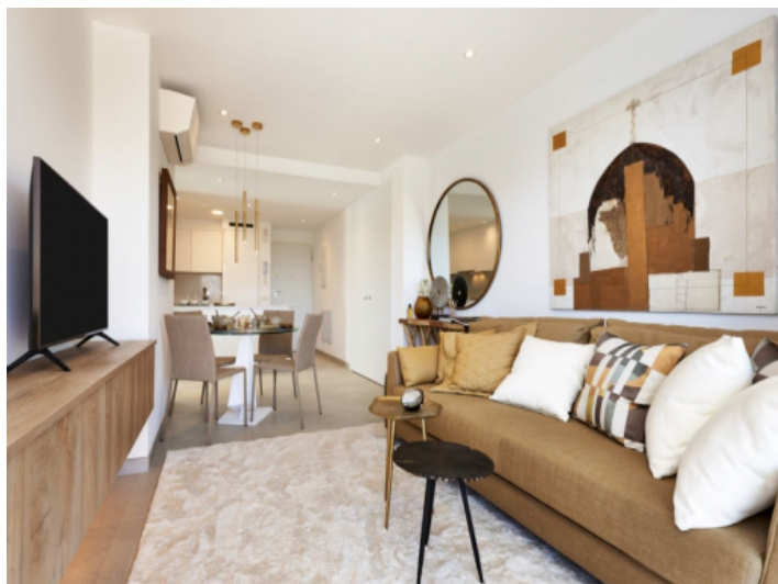
Living room overlooking the kitchen