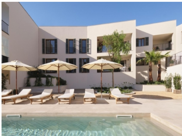
Exterior view and pool