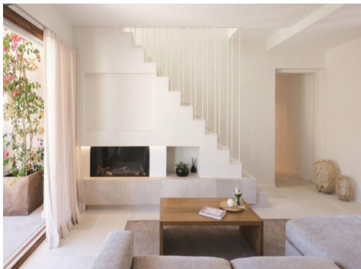
Modern living area