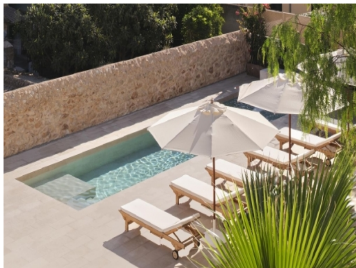
Lovely pool area