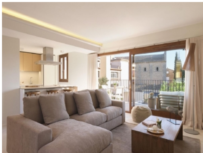
Open living area and kitchen