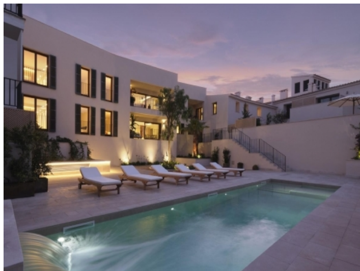
Pool area by night