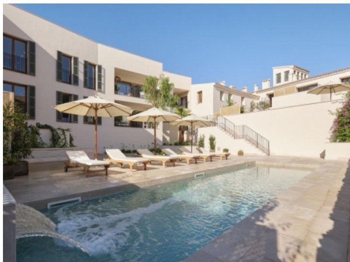
Spacious communal area