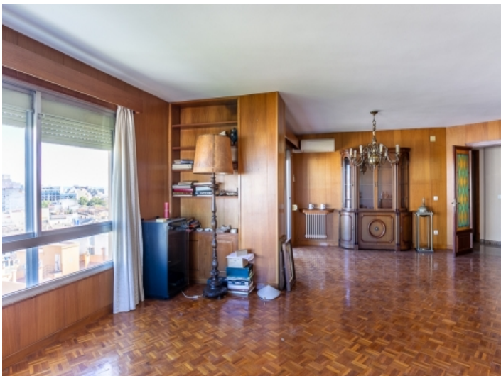
Alternative view of the living area