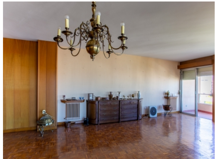
Space for an open living and dining area