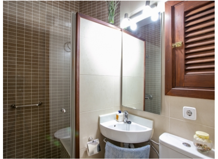
Bathroom with shower