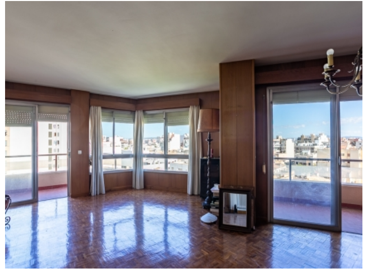
Light flooded living area