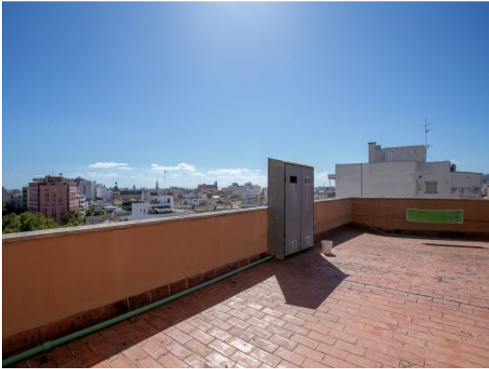
Splendid roof top terrace