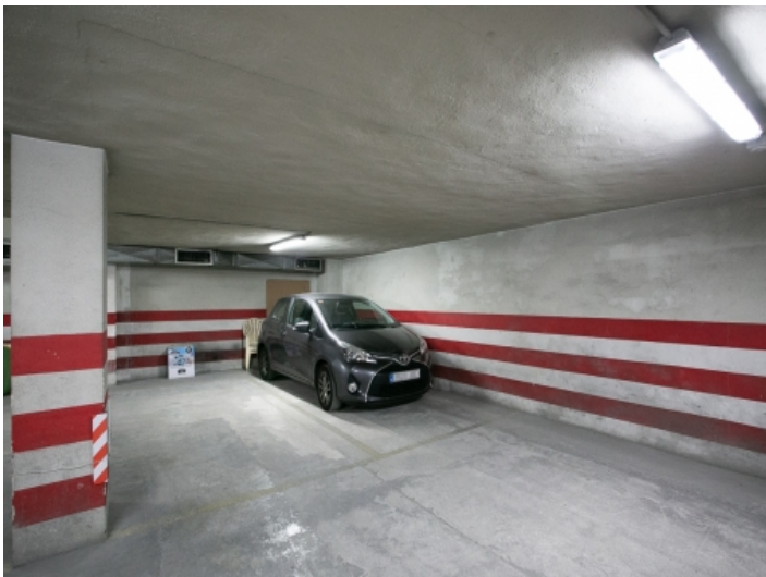
Garage parking included