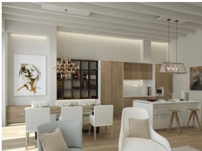
Stylish living and dining area