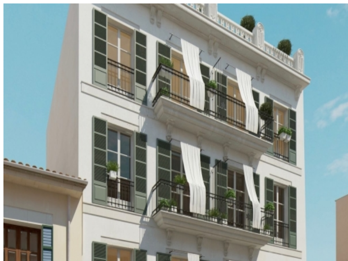
Exterior view of the building