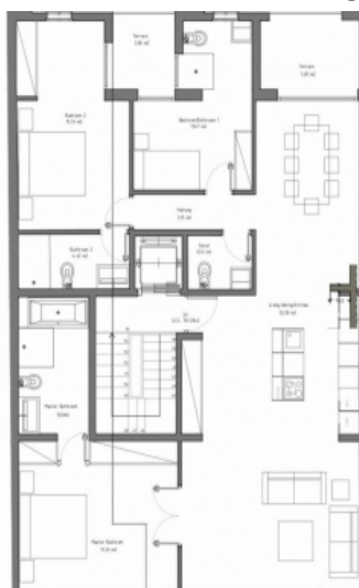
Plan of the apartment