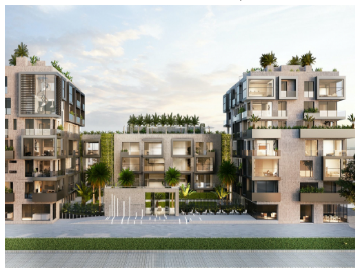
Exterior view of the residential complex