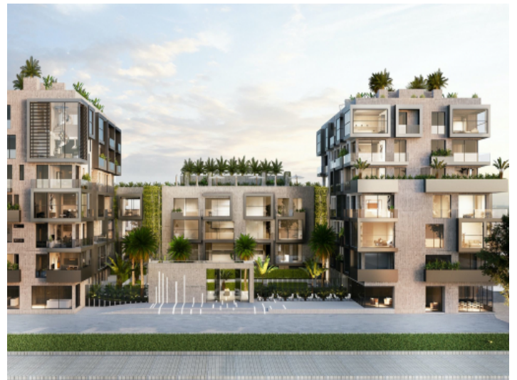
Exterior view of the residential complex