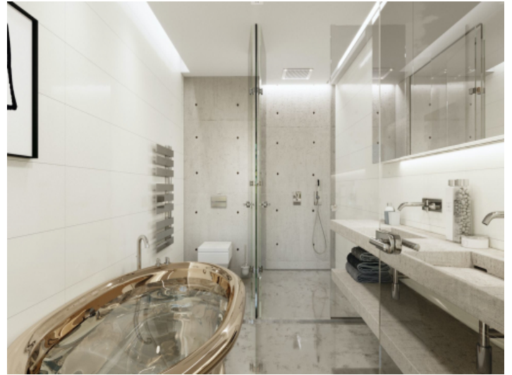
Alternative bathroom style