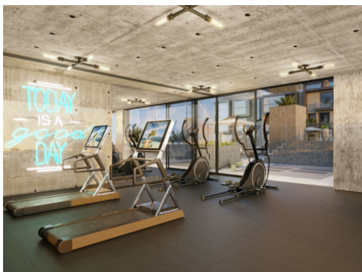
Community gym area