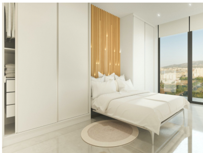
Inviting double bedroom