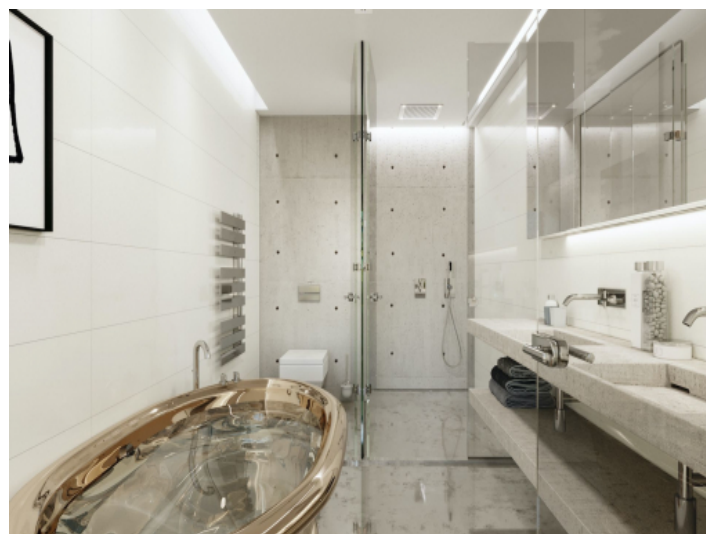
Alternative bathroom style