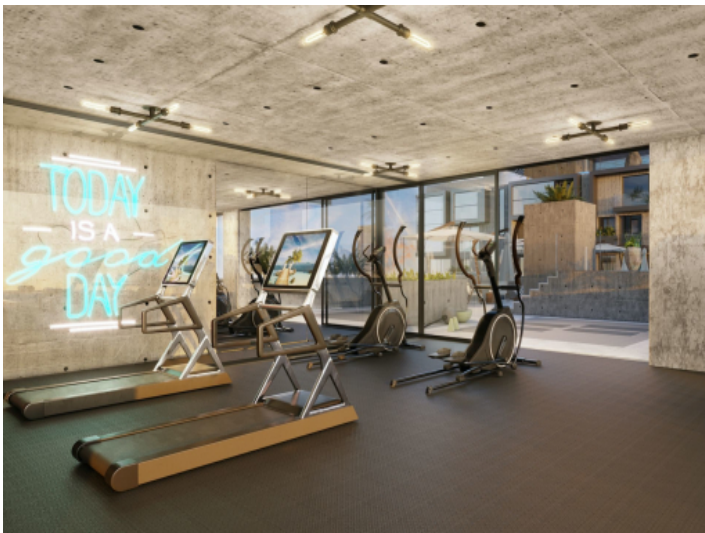
Community gym area