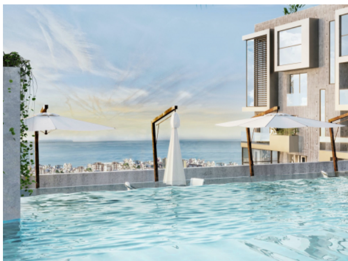
Impressive roof top pool