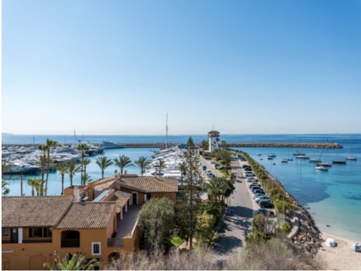
Stunning sea views of the apartment