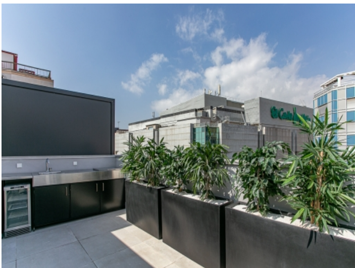
Spacious bbq area