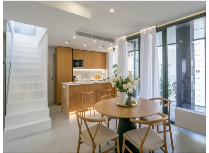
Beautiful, bright dining area