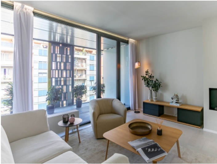
Living area with large window front