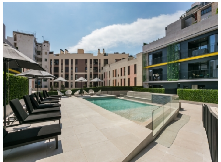
Fantastic communal pool area