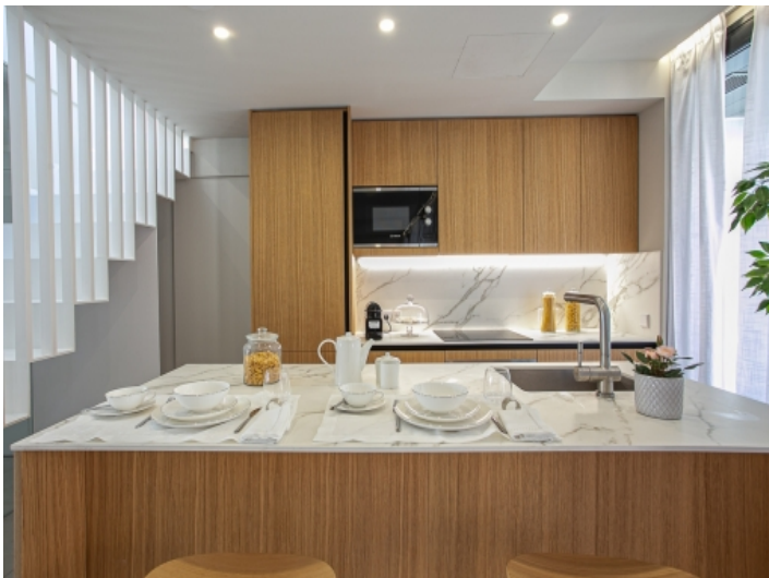
Open, high quality kitchen