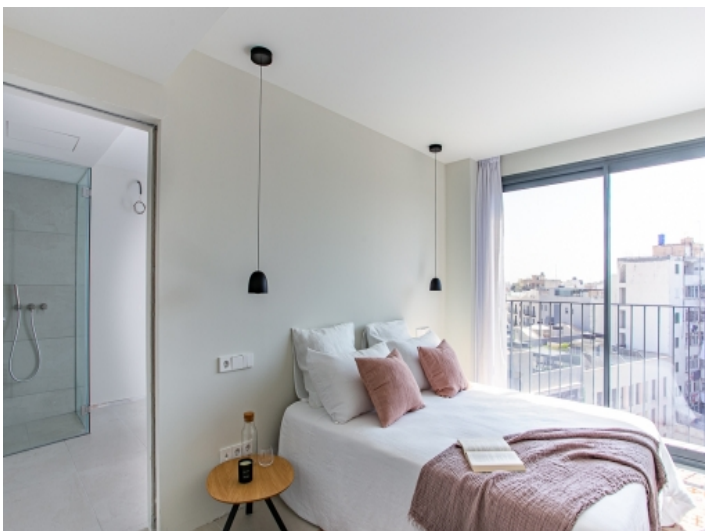
Bright double bedroom