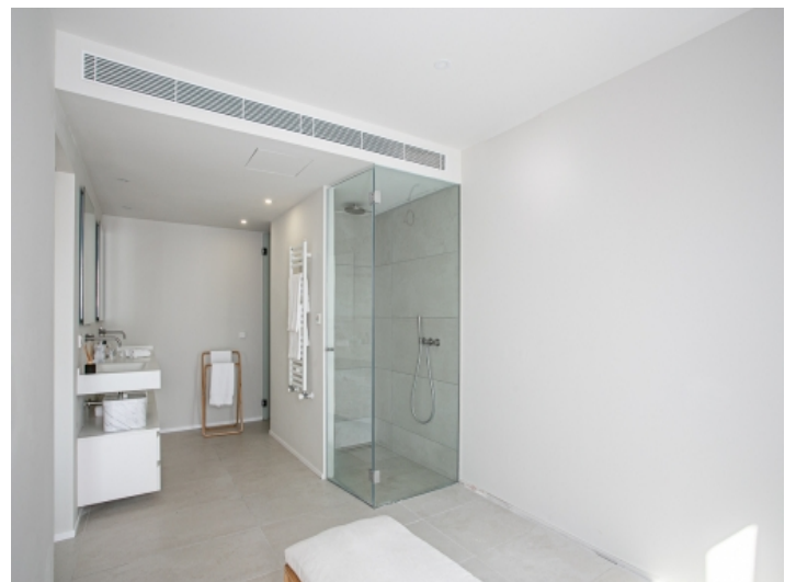
Modern bathroom en suite