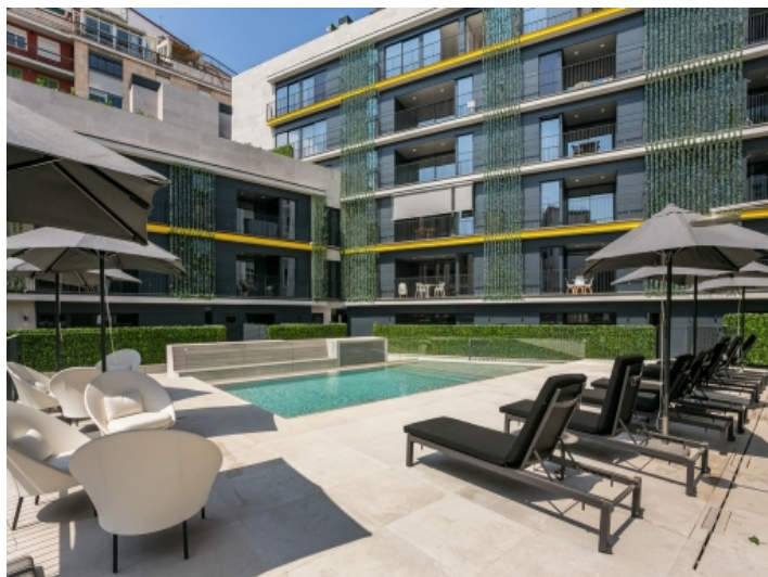
Exterior view and pool area