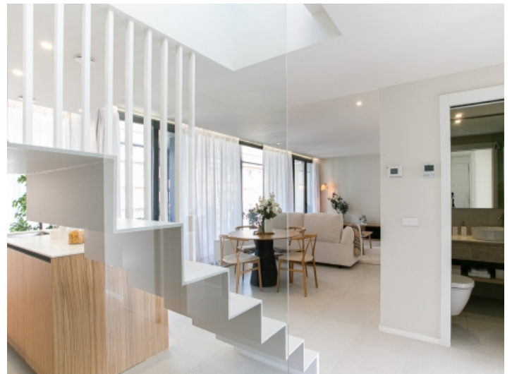
Modern and bright living and dining area