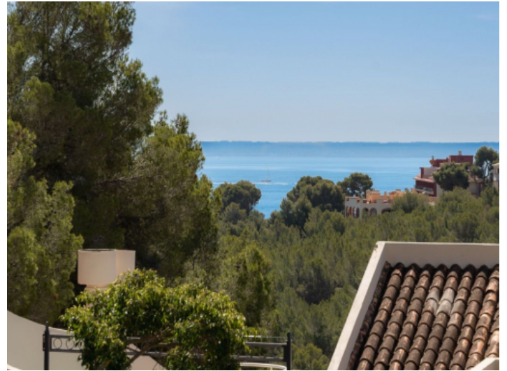
Partial sea view