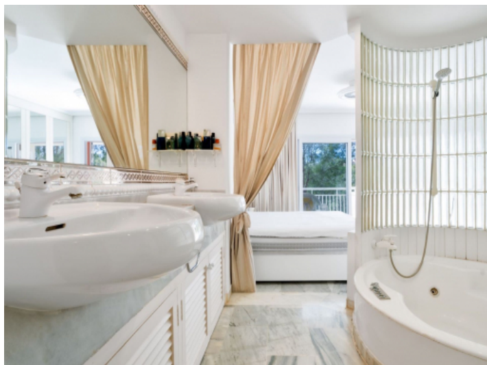
Masterbathroom en suite