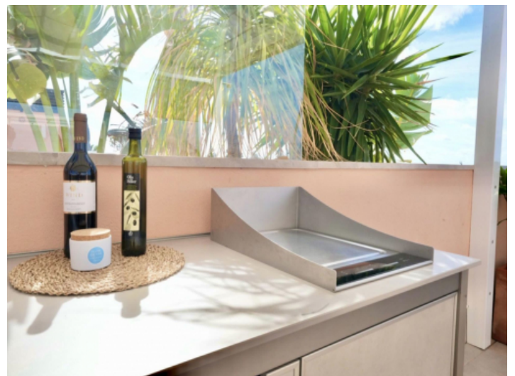
BBQ area rooftop