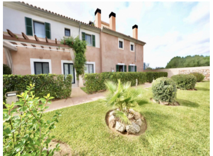
View to th building