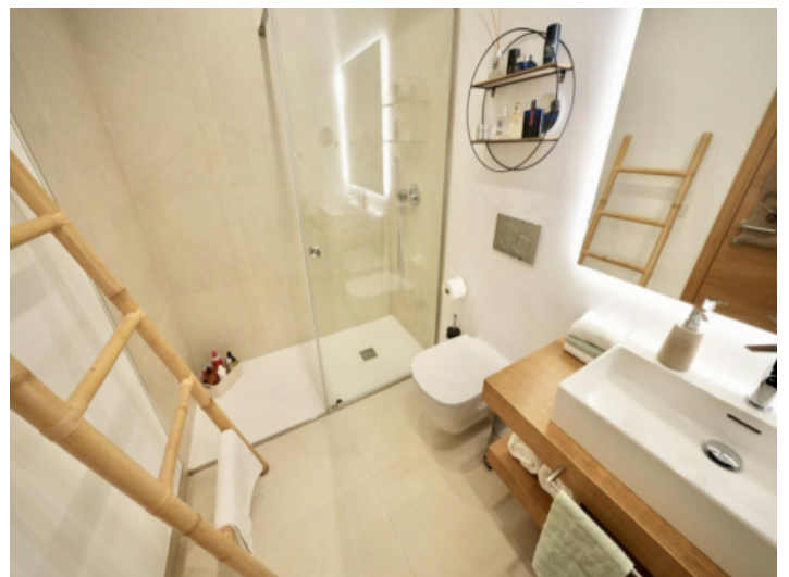
Walk in shower