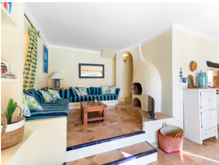
Comfortable living area with fireplace