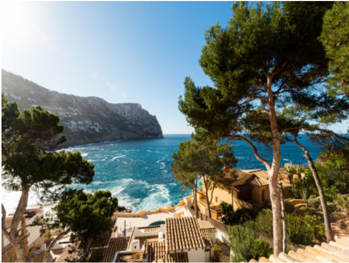
Beautiful sea views