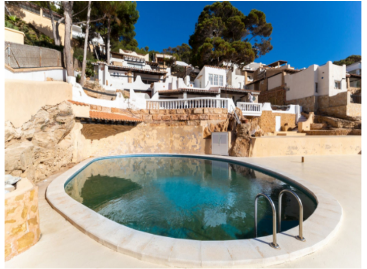
Community pool and sundeck