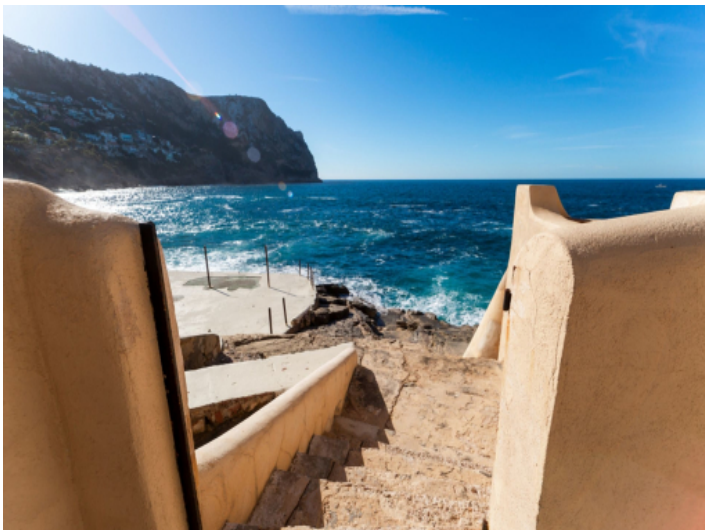
Direct access to the sea