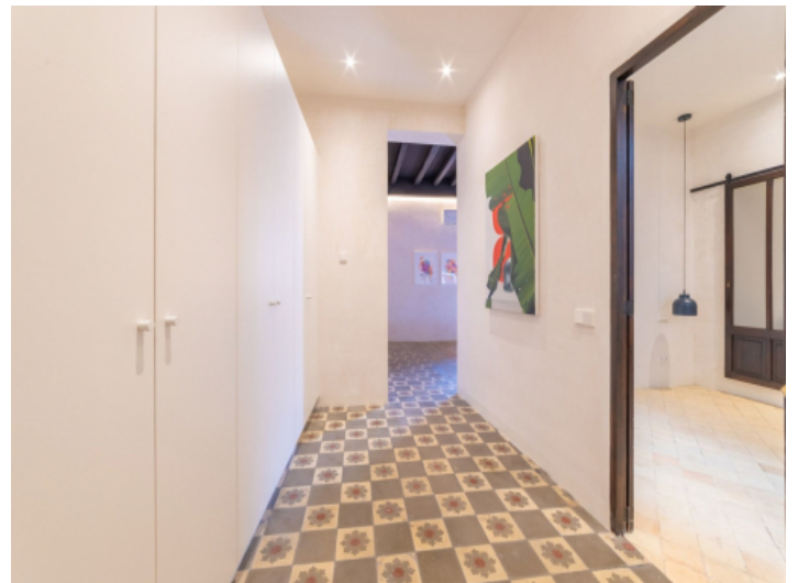
Hallway with fitted wardrobes