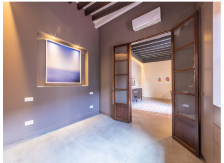
Flat with 2 bedrooms