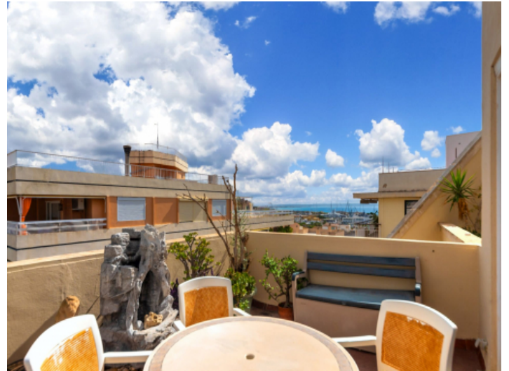
Top location and parking