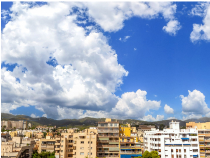
Views over the city