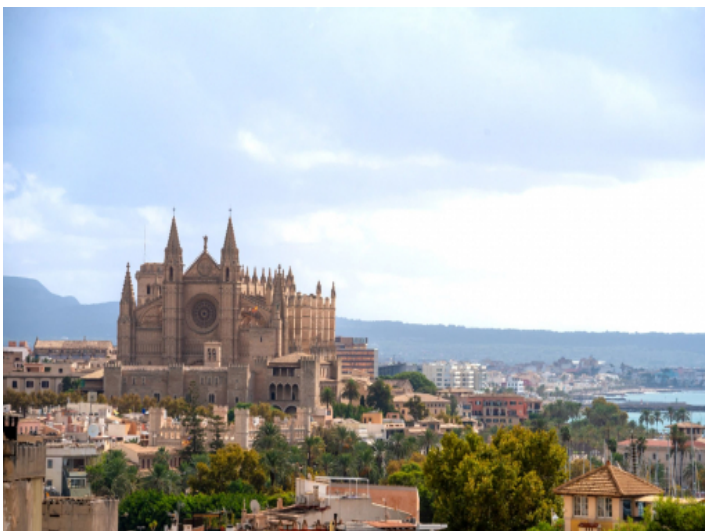
Views up to the cathedral and harbour