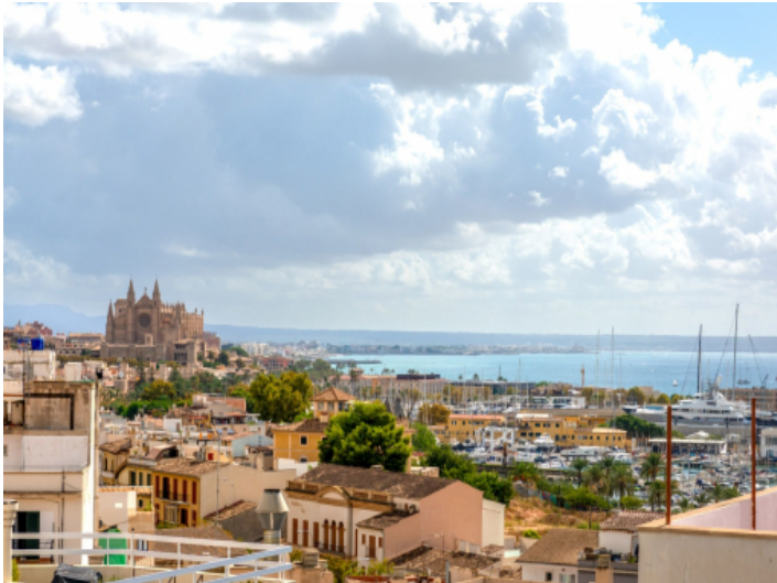
Views to the cathedral and harbour