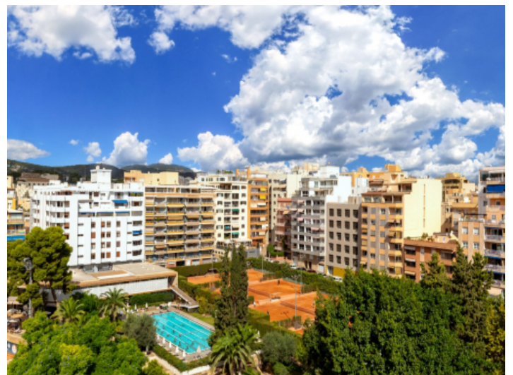
Close to the Sporting Tennis Club