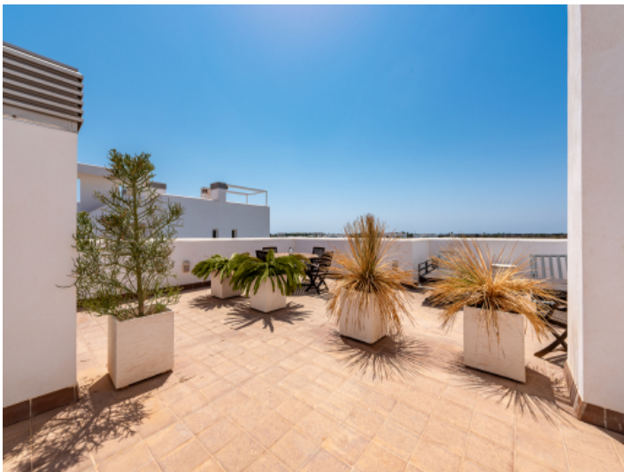
Rooftop dining area