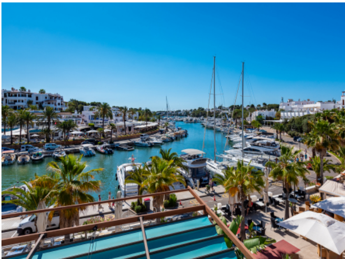
Harbour of Cala D'Or