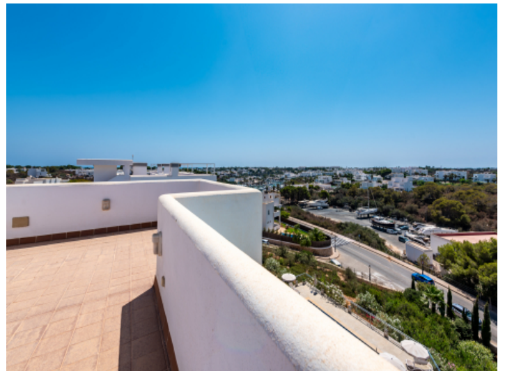
Views up to the harbour