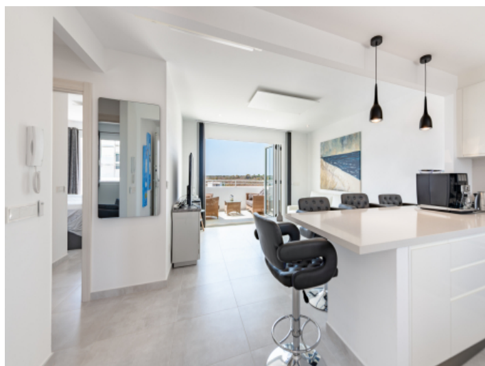
View from the kitchen to the living area