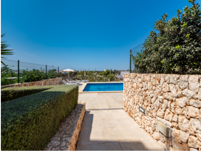
Access to the community pool