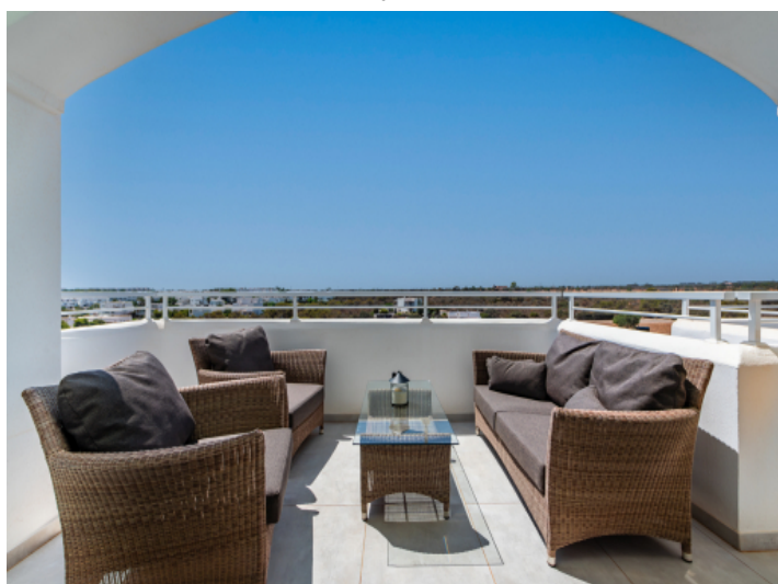
Terrace in front of the living area