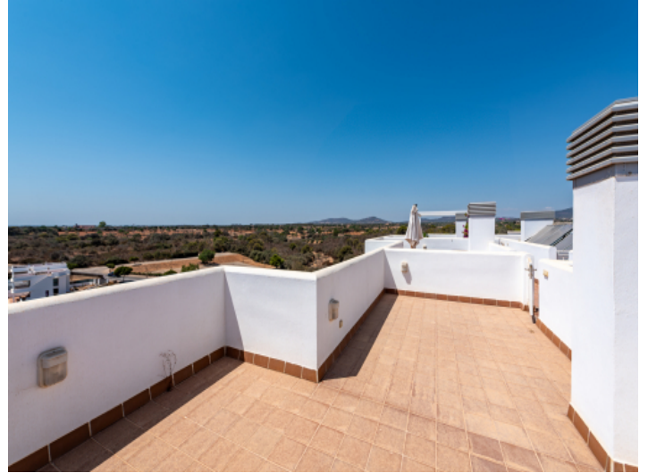
views from the rooftop terrace