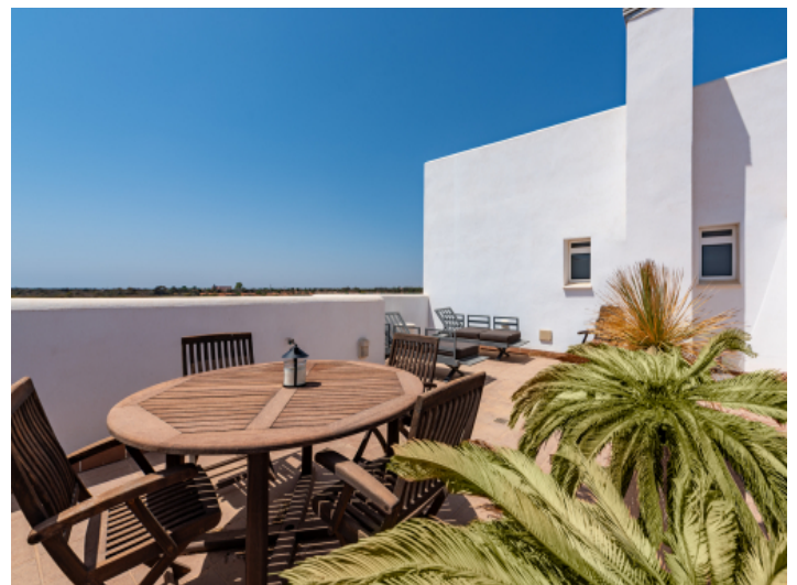
Dining area on the rooftop