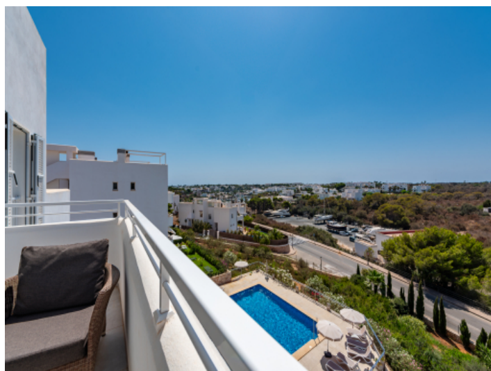
View to the community pool