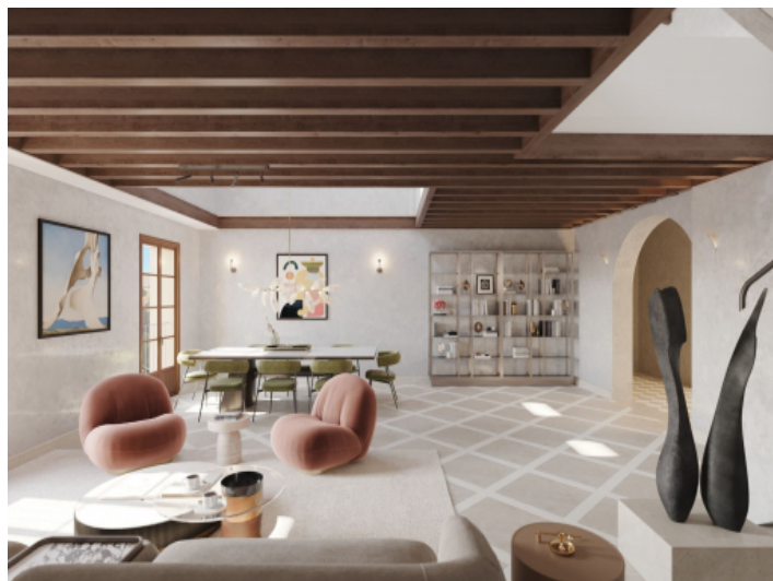
Open and lightflooded rooms