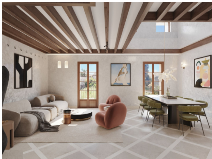
Noble living and dining area