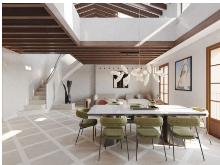
Spread over 2 levels