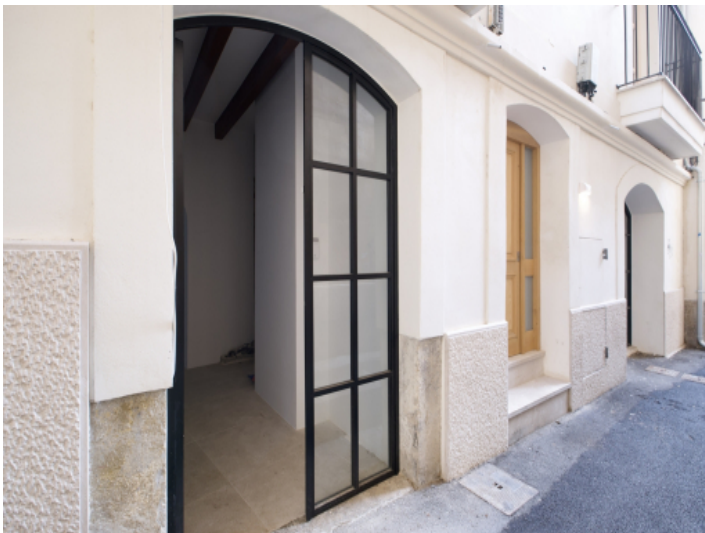
Views from the street