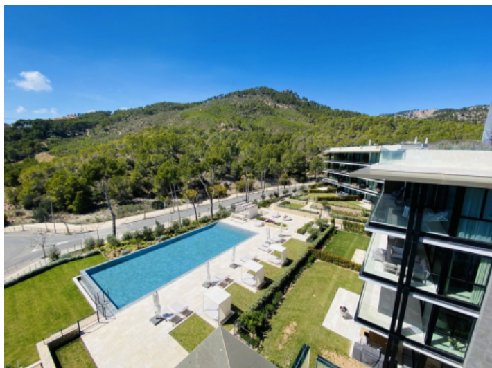
View from the rooftop to the community