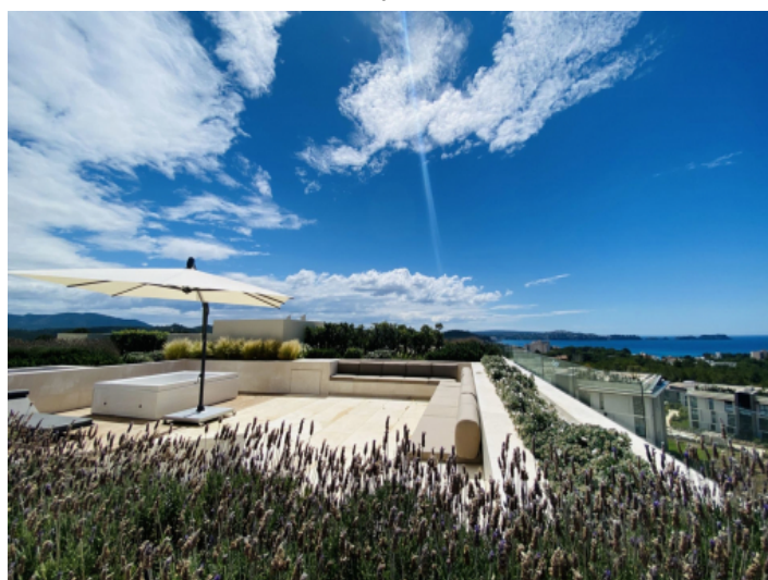
Rooftop terrace with views