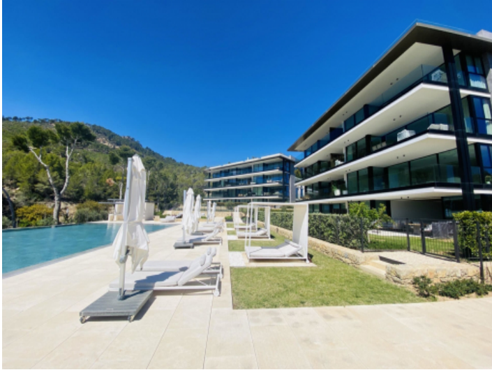
Community pool and garden