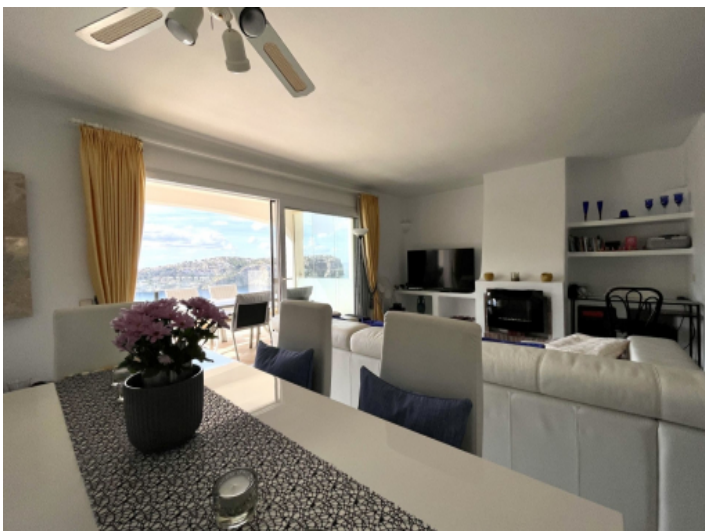
Dining and kitchen area