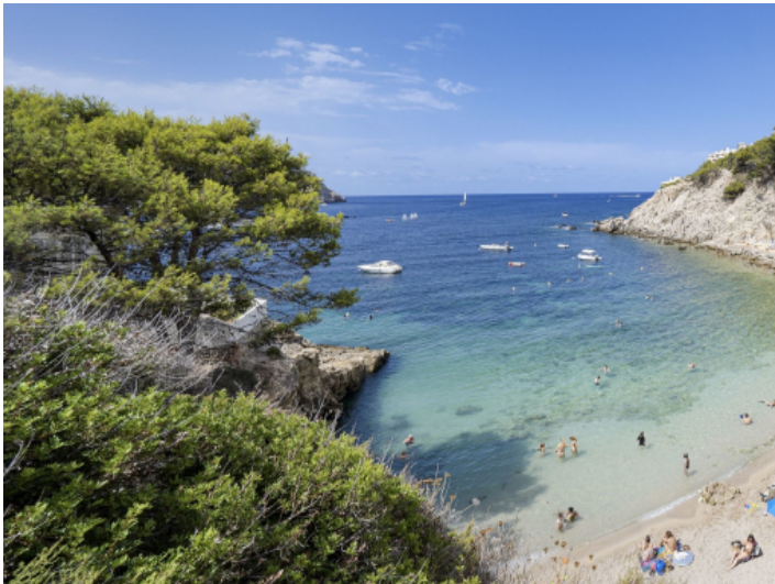
Not far away from the beach