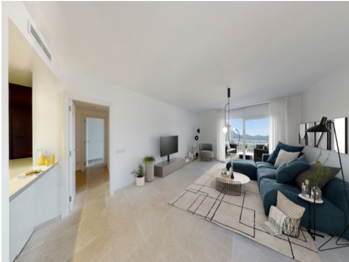
Living area with seaviews