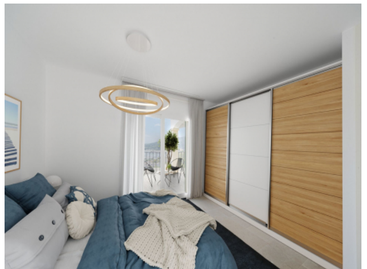
The 3rd bedroom