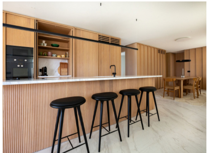
Large kitchen island