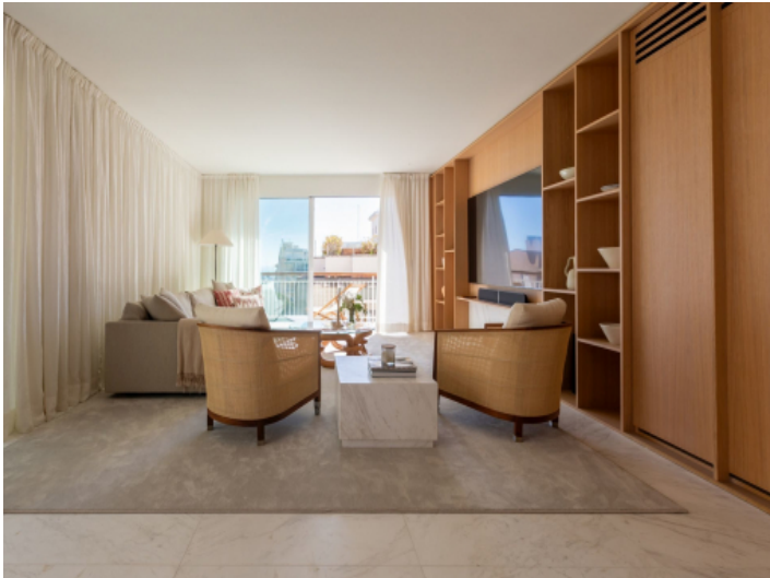
Large living area