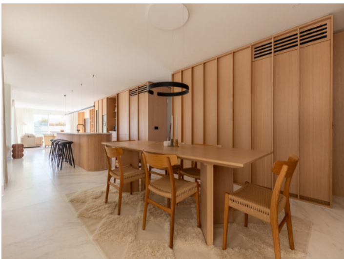
Comfortable dining area