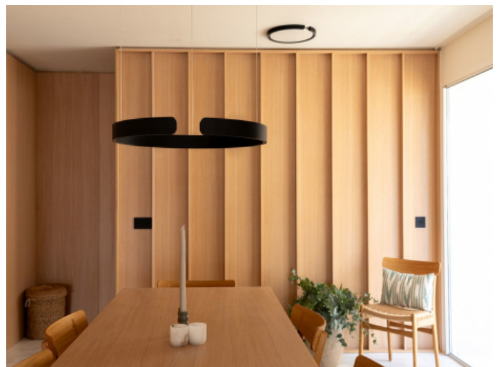
Stylish dining area