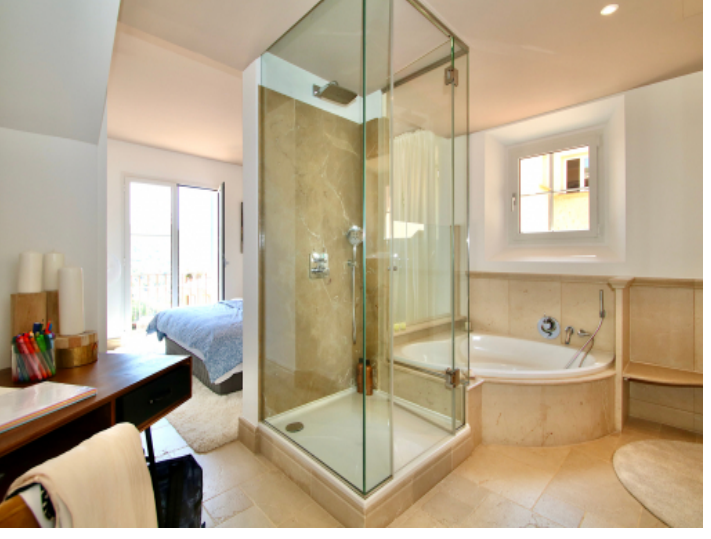
Bathroom with shower and bathtub