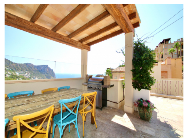
Sunny roof terrace