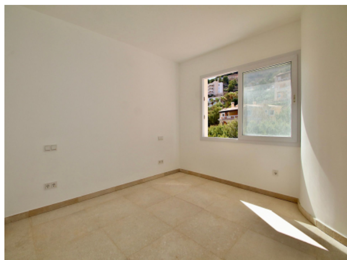
Natural stone floors and underfloor heating in the whole flat