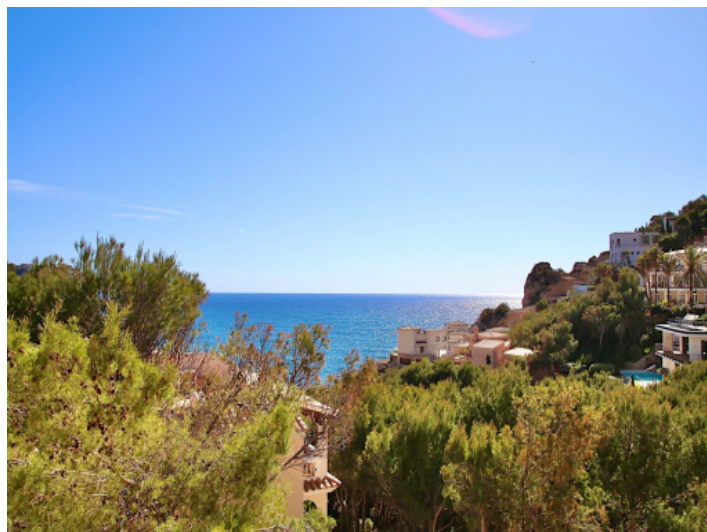
The penthouse is close to the harbour and its restaurants