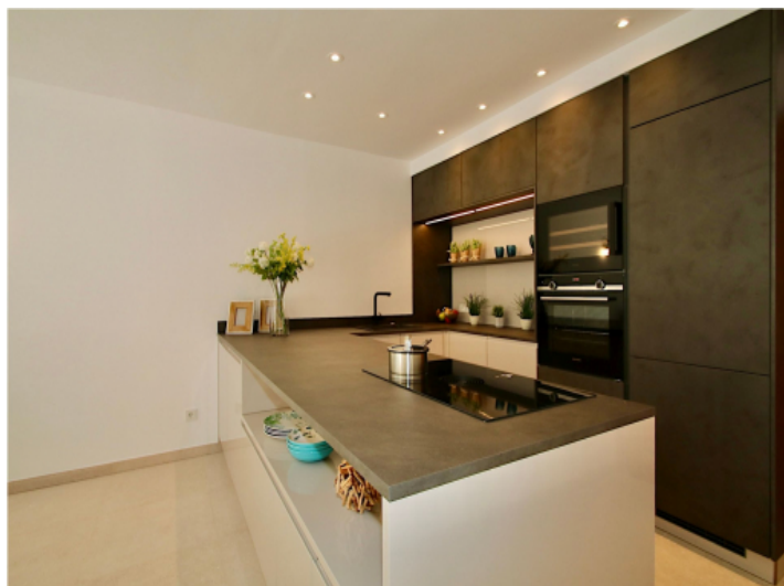
Modern kitchen with kitchen island