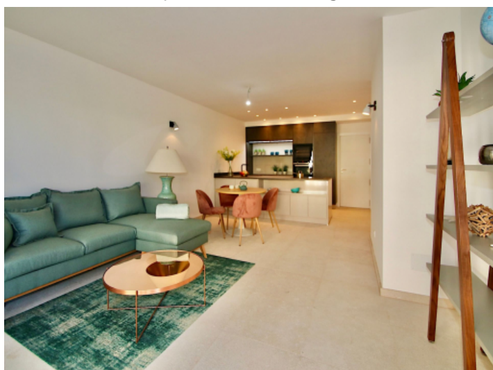
Bright and cozy living and dining area