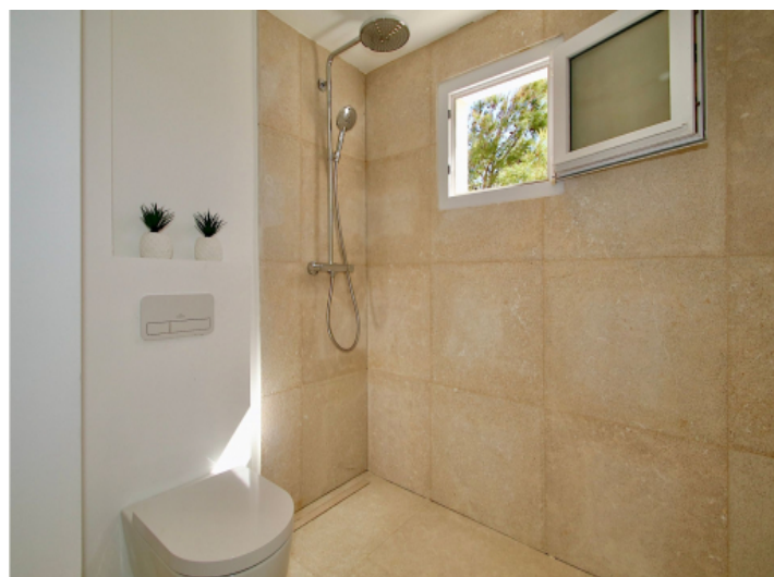
Bathrooms in a modern style