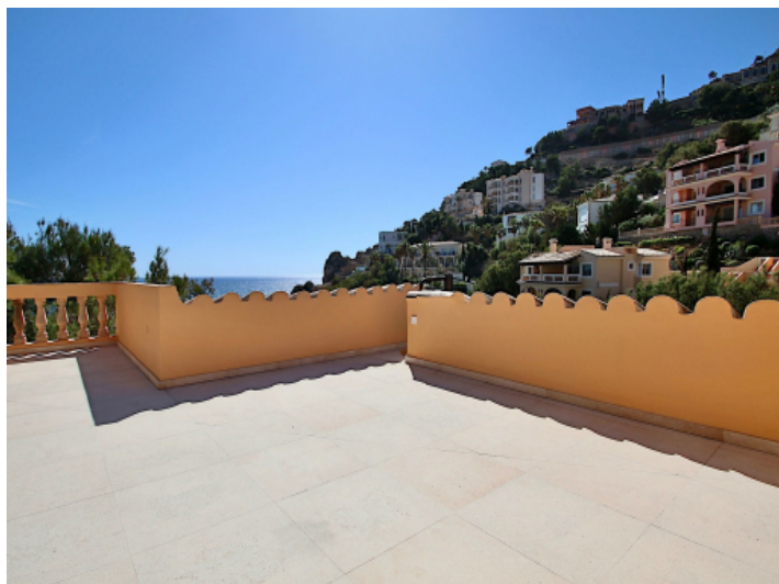
Rooftop terrace with amazing views