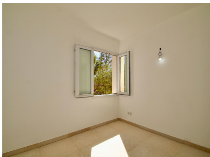
The 2nd bedroom