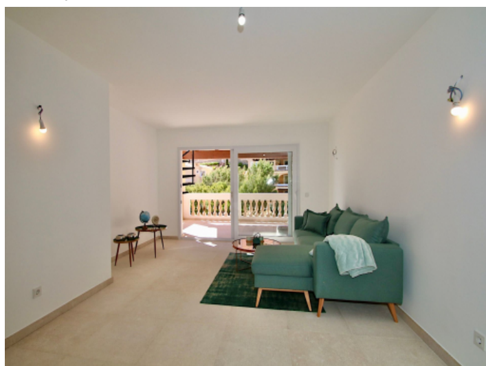
Living area with porched terrace