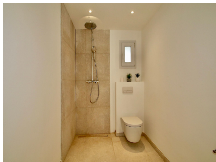
Hans Grohe and Duravit sanitary equipment