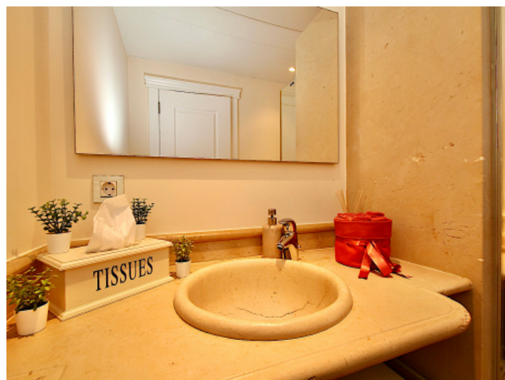
Bathroom with washbasin