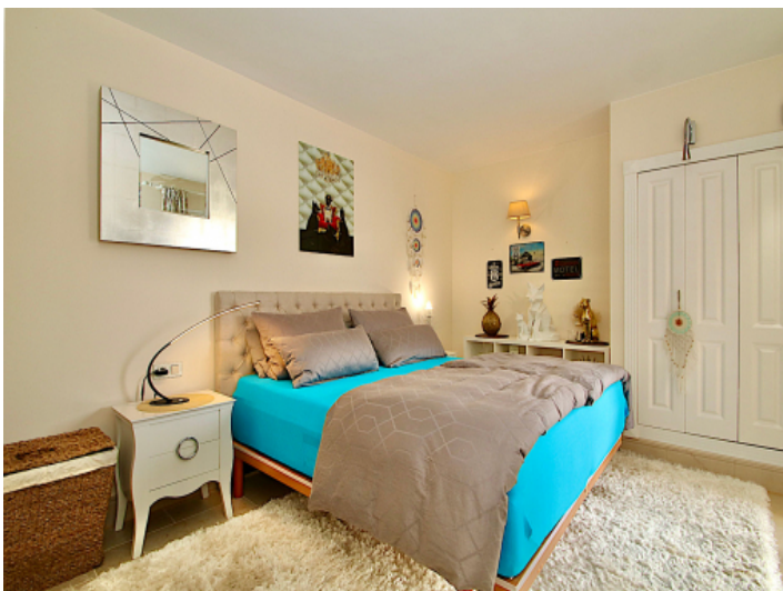
Bedroom with built-in wardrobe