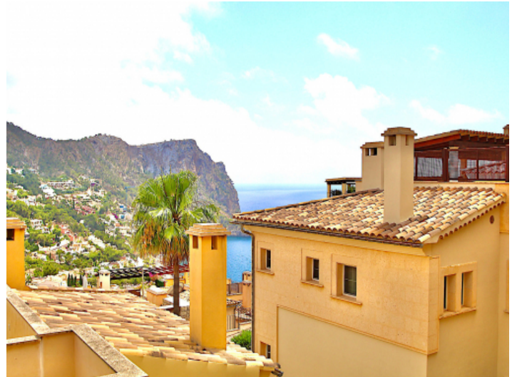
Unique sea views