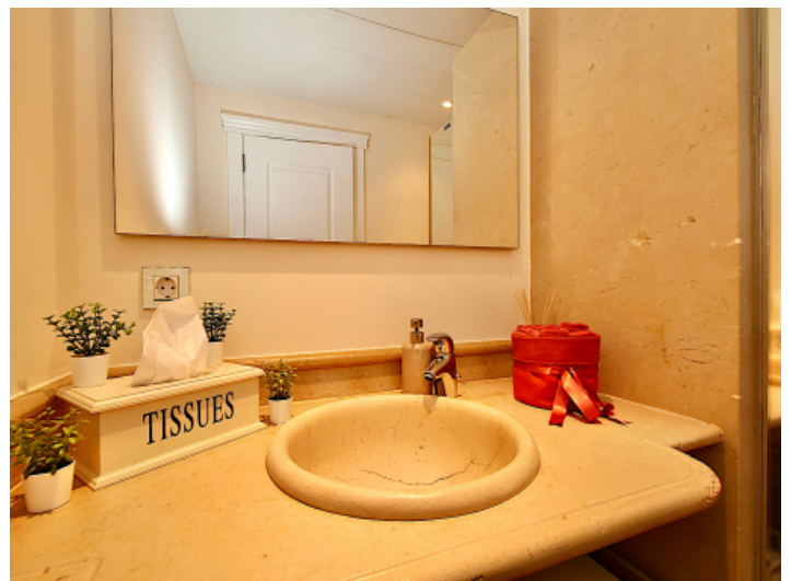
Bathroom with washbasin