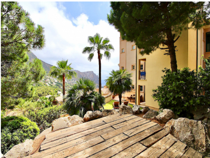
Mediterranean sea views from the balcony