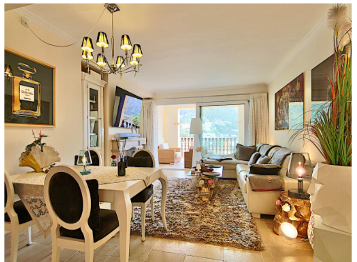
Dining area from the apartment