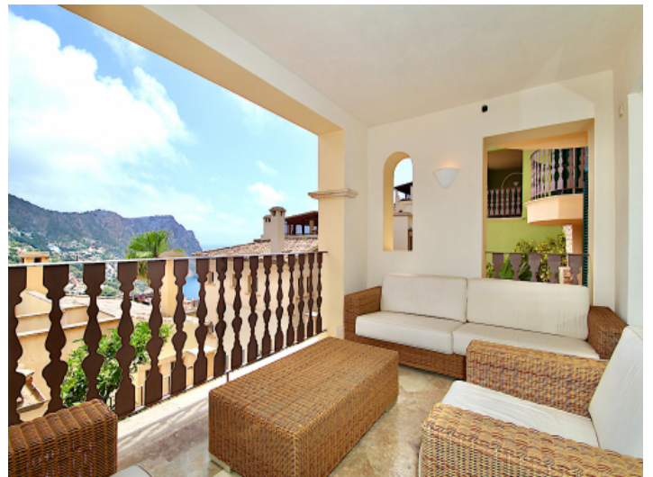
Balcony with lounge area