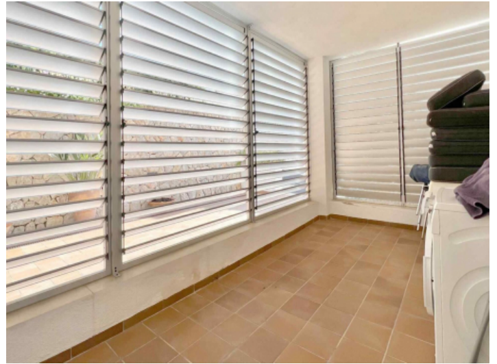
Storage room with washing machine