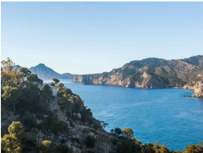
Unique sea views