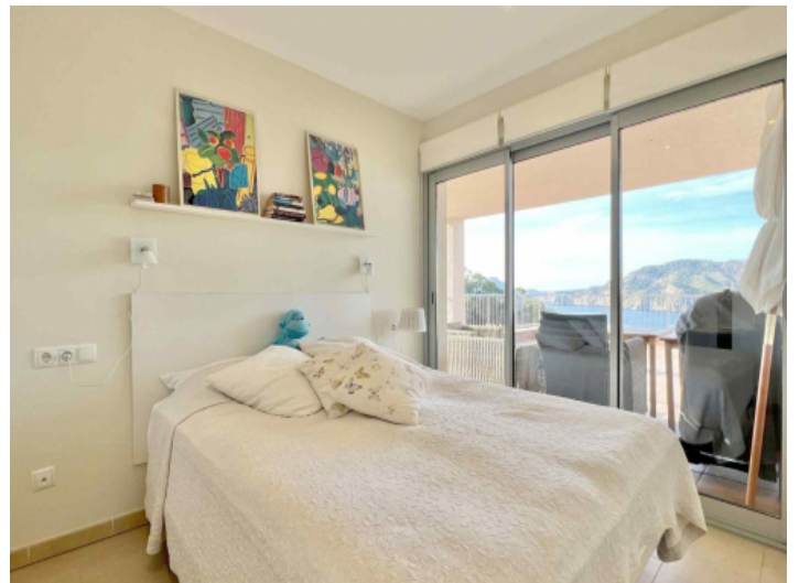
Bedroom with double bed