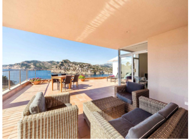
Lounge area on the terrace