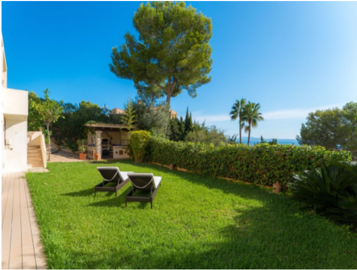
Private garden with sea views