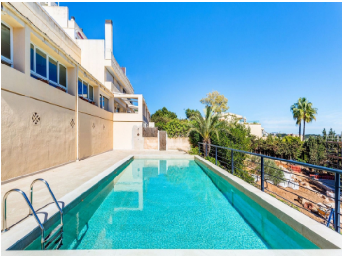
Large community pool