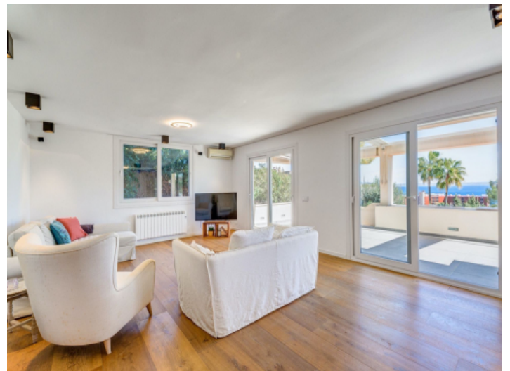
Living area with direct terrace access