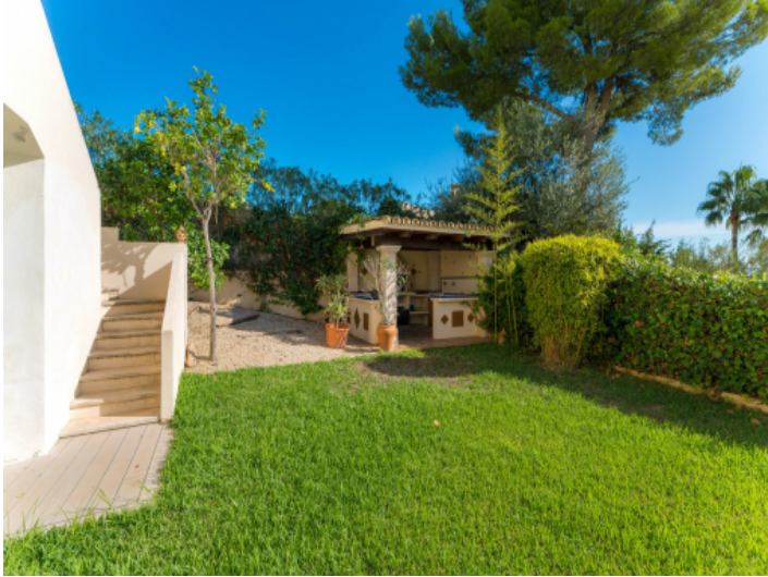
Garden with BBQ area