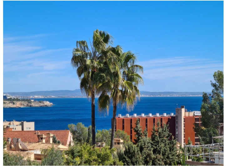
Beautiful sea views