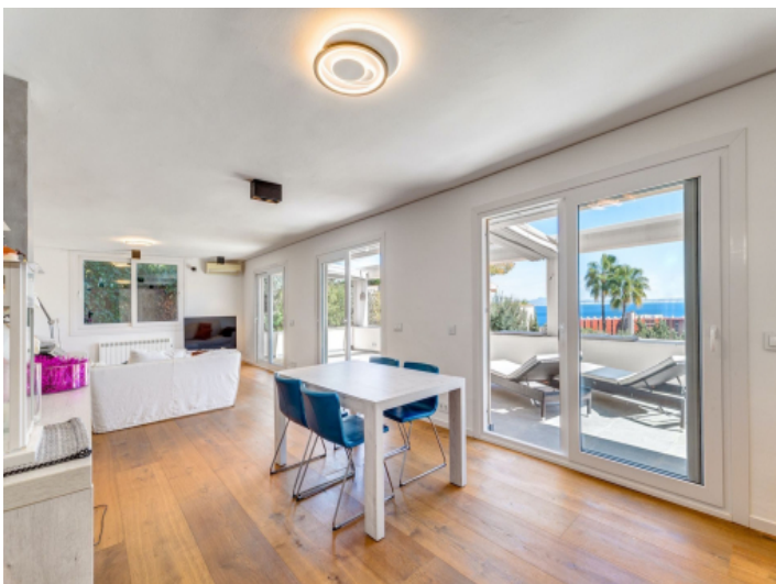
Bright dining area