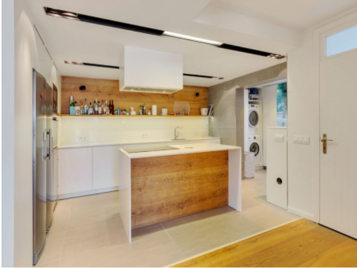
Kitchen with island