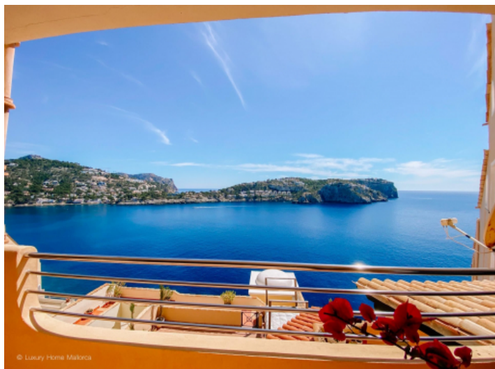
Sea view terrace