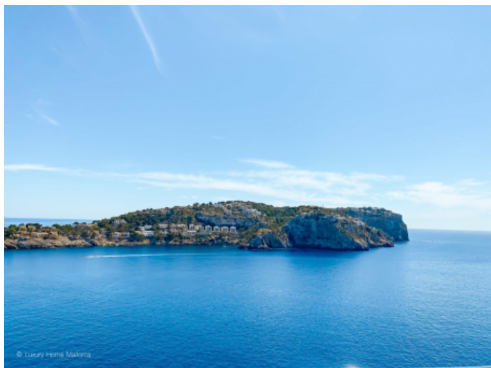
Panorama sea views