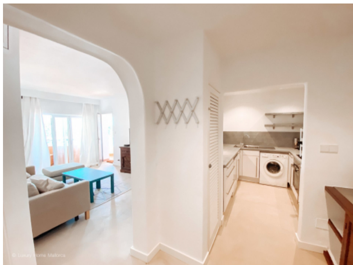
Living area / Kitchen