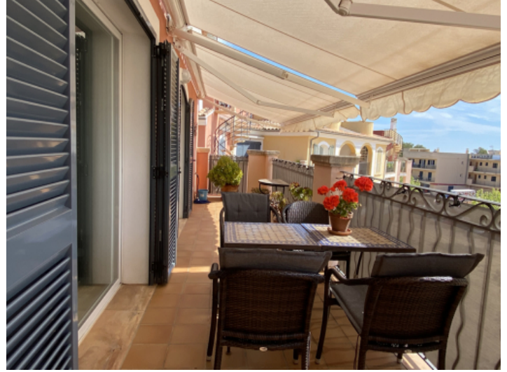
Balcony with sitting area