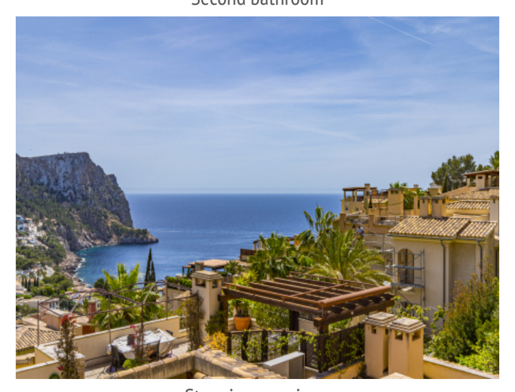
Stunning sea views