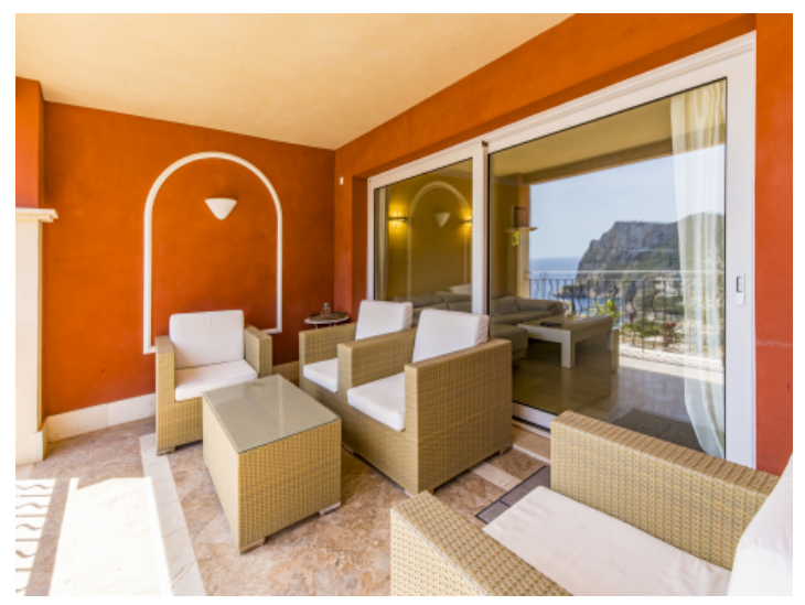
Terrace with lounge area