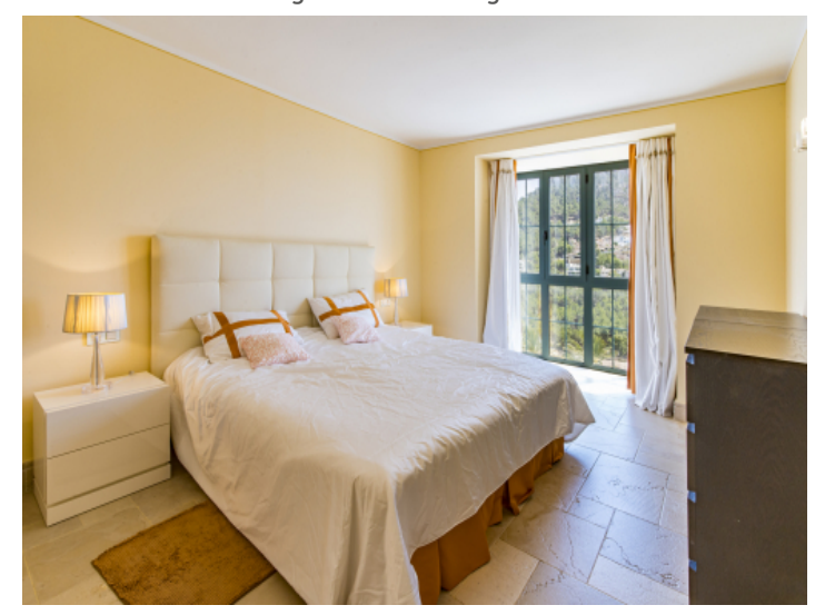
First double bedroom