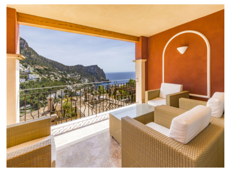
Wonderful sea view terrace