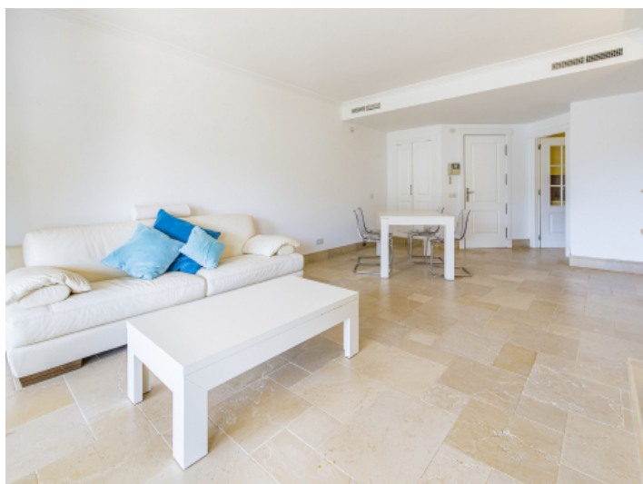
Spacious living and dining area