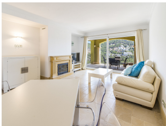
Living area with fireplace