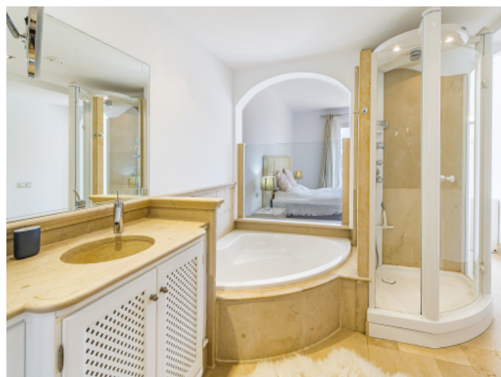
One of 2 bathrooms