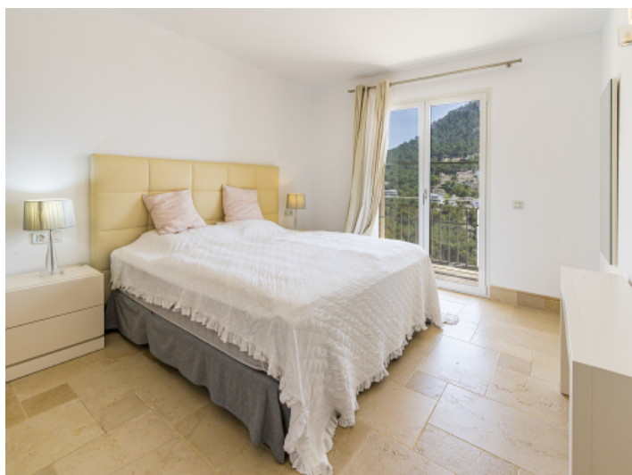
One of 2 bedrooms