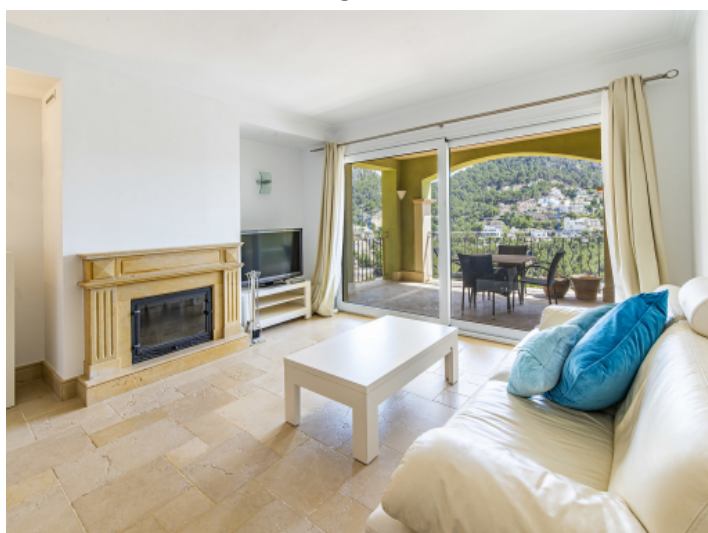
Living area with terrace access