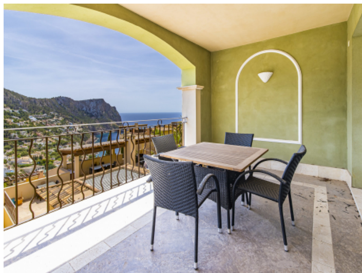
Covered sea view terrace