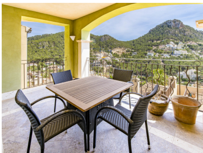
Beautiful outdoor dining area