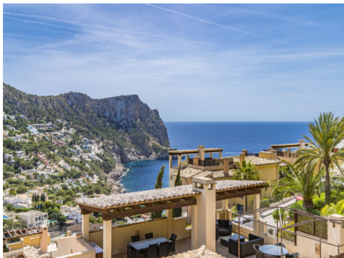
Stunning sea views