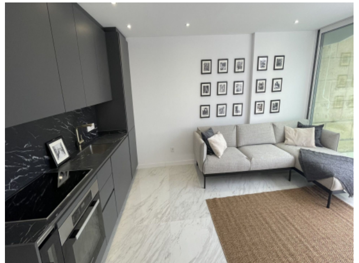
Living area and kitchen