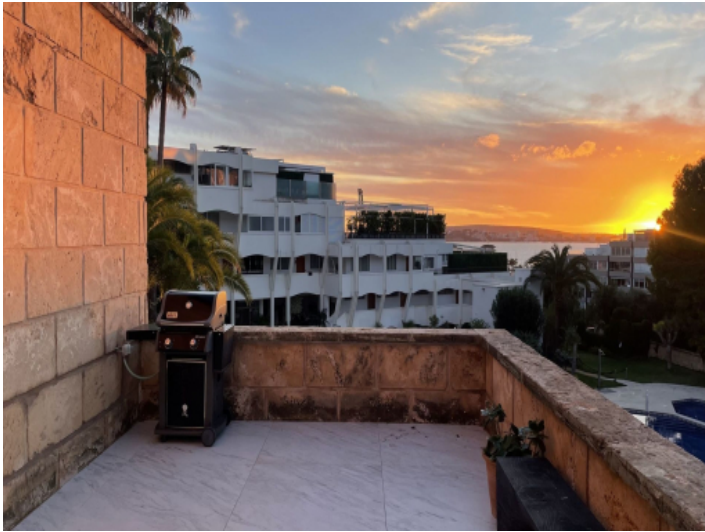
Perfect bbq terrace