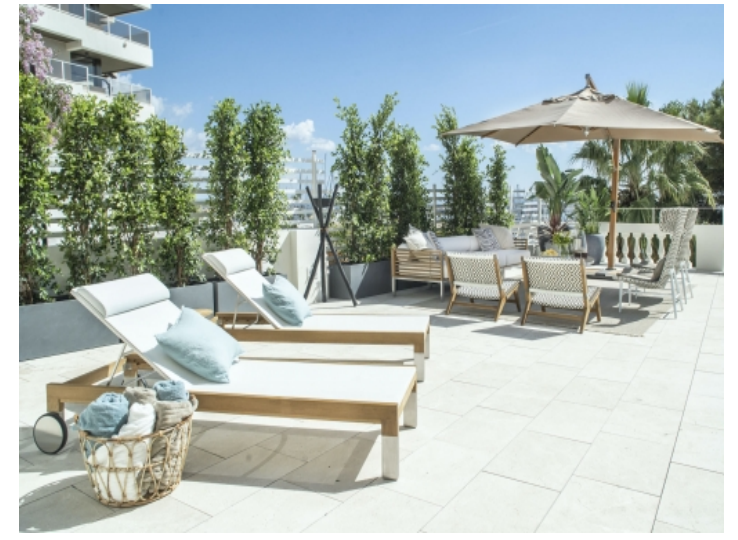
Inviting sun loungers on the terrace