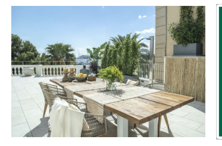
Paseo Maritimo search for property MAL-077627