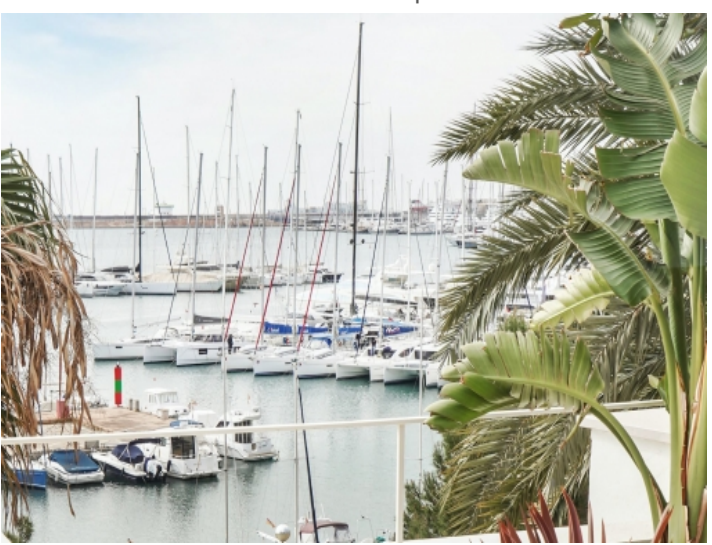
View to the harbour