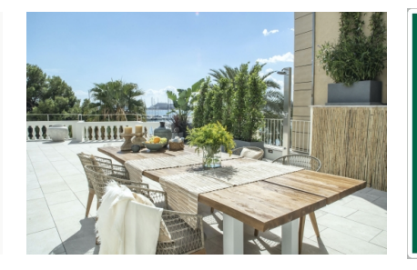
Paseo Maritimo search for property MAL-077627