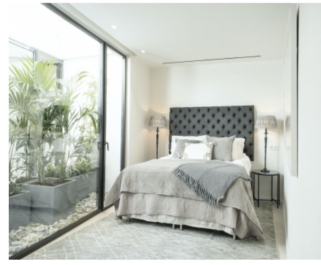
Double bedroom with patio views