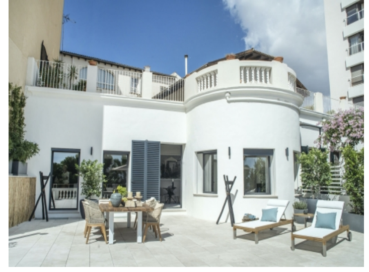
Exterior view of the apartment