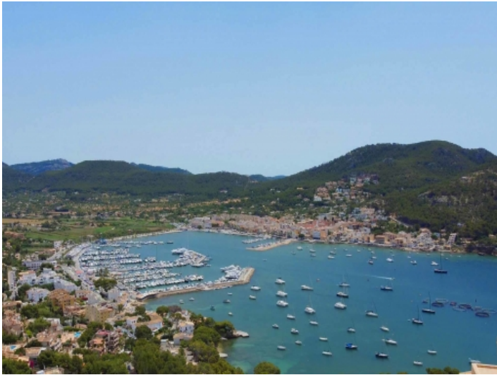
Fantastic view over the bay of Port Andratx