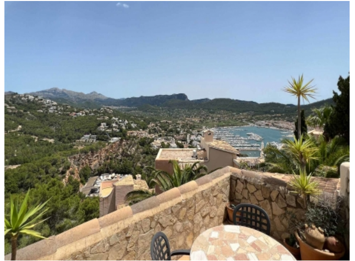
Sea and mountain view