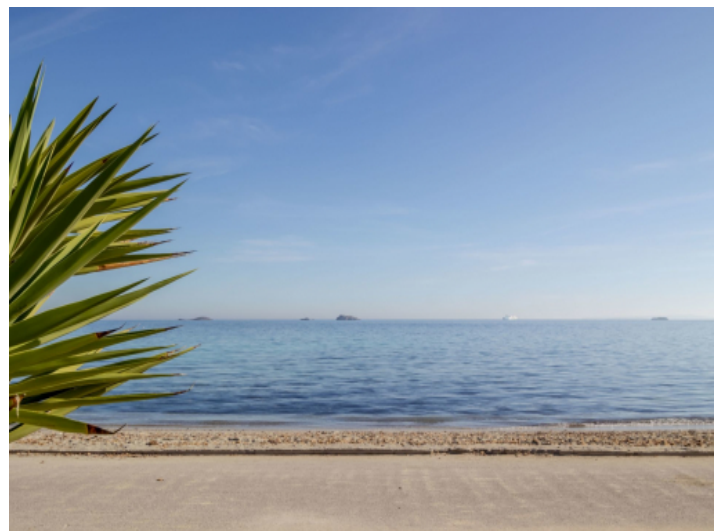
Beach in front of the door