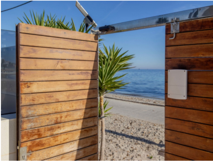
Access to the beach