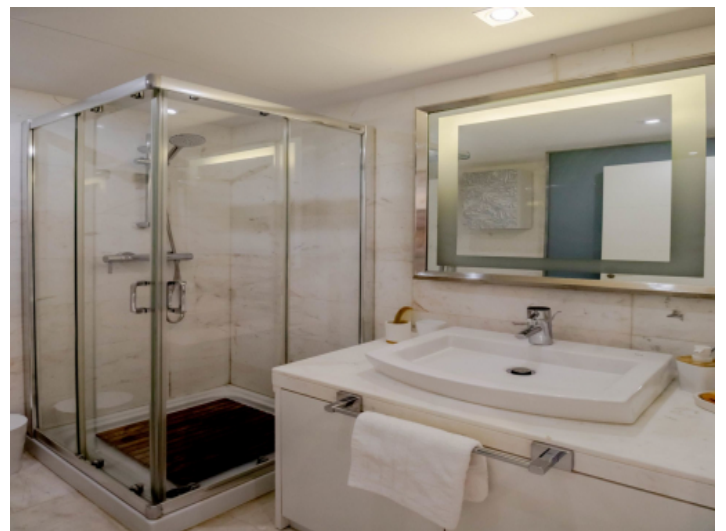
Apartment with 2 bathrooms