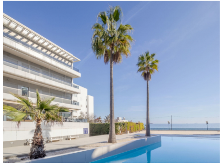
Community pool in front of the beach