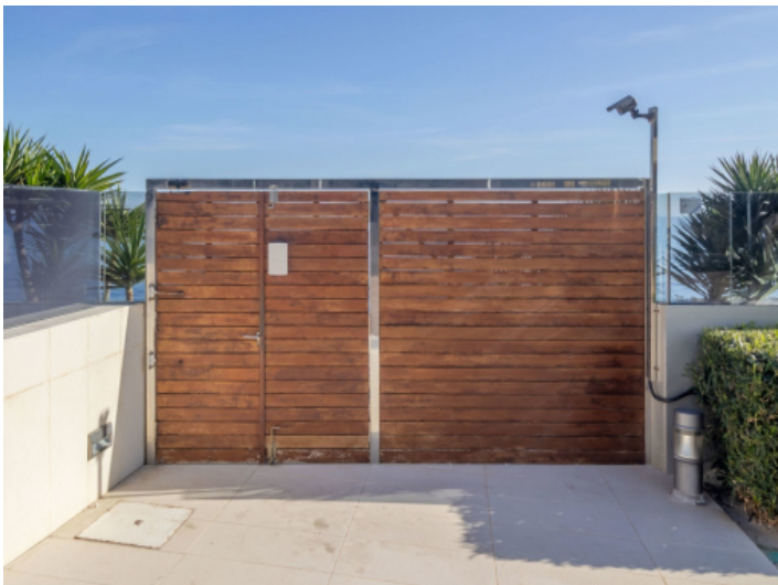
Access to the beach