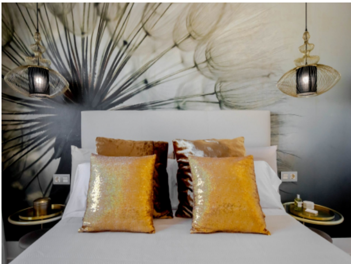
One of 2 bedrooms