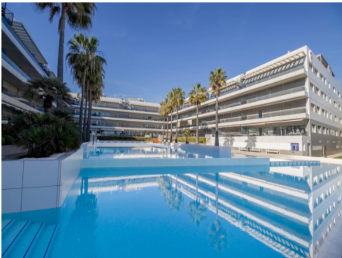
View to the complex