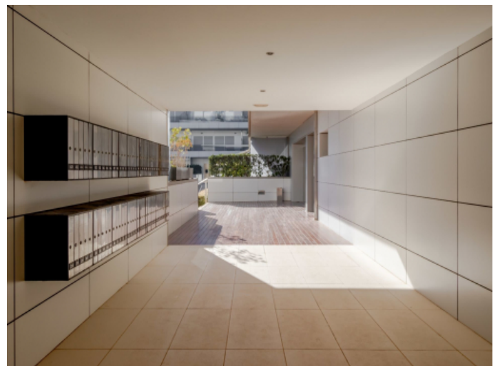
Entrance hall of the building