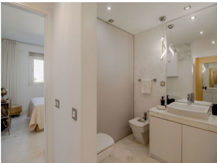
Bathroom en suite