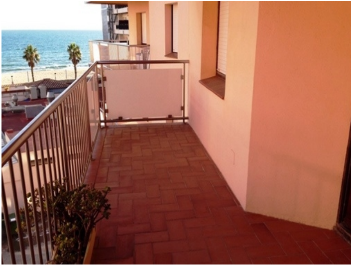
Large balcony with sea view