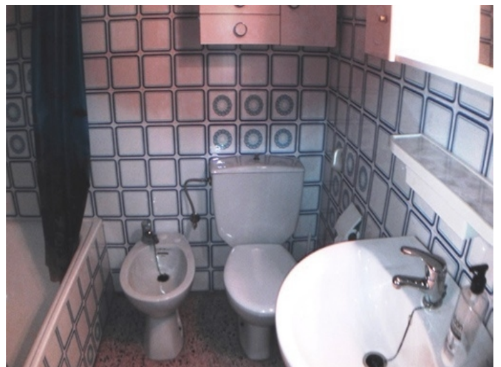
Bathroom with nostalgic tiles