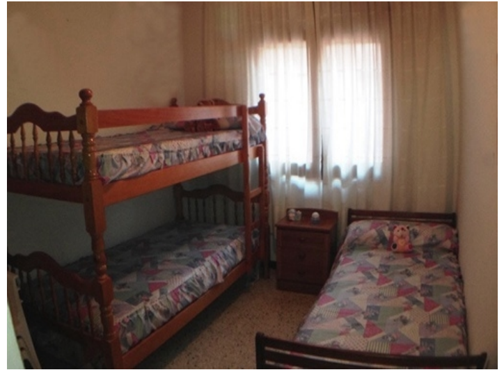
Bedroom with 3 single beds