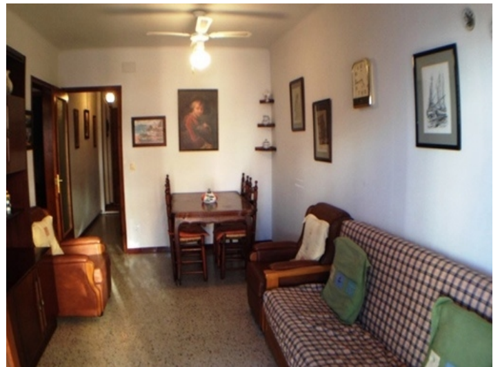
Spacious living room