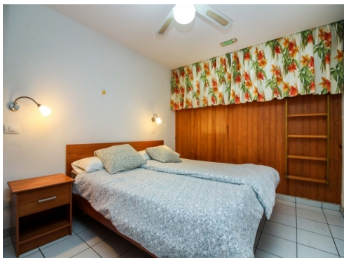
One of 4 bedrooms