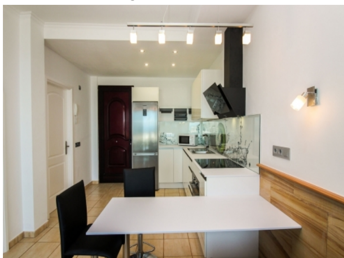
Open kitchen with dining area