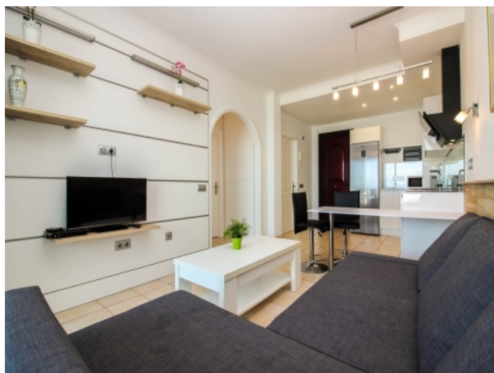
Living area with open kitchen