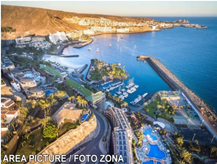
AREA PICTURE / FOTO ZONA