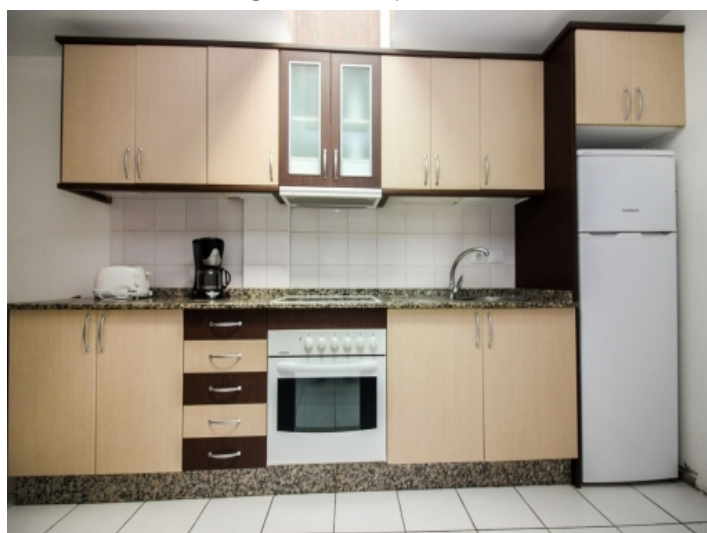
Fully equipped kitchen