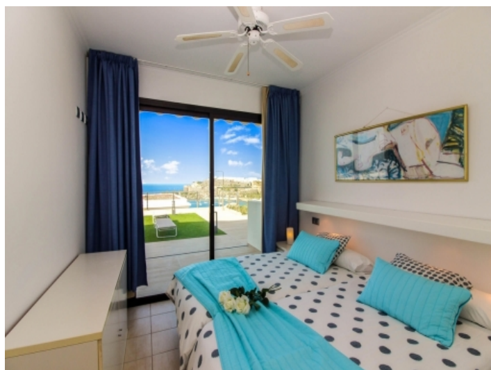
Bedroom with sea views