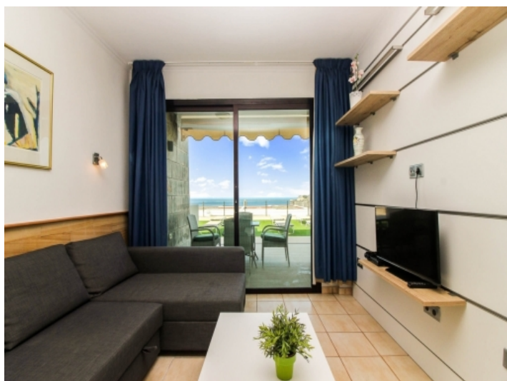
Living area with sea views