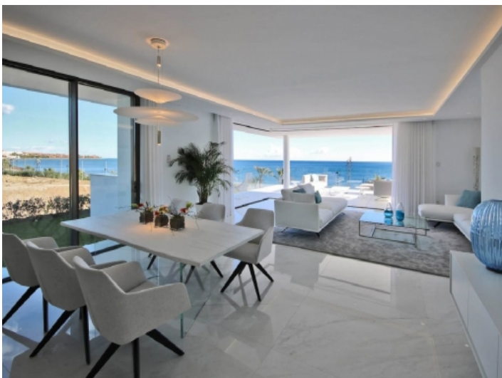
Generous living and dining area