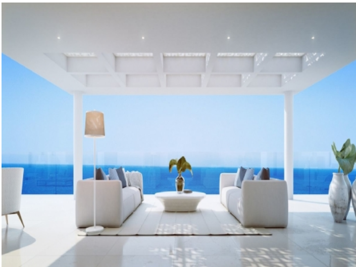
Impressive sea view terrace