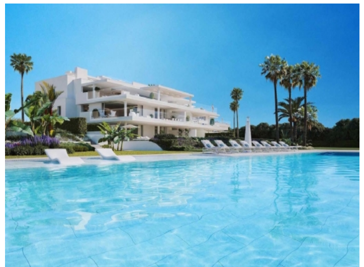
The communal pool invites to enjoy the summer