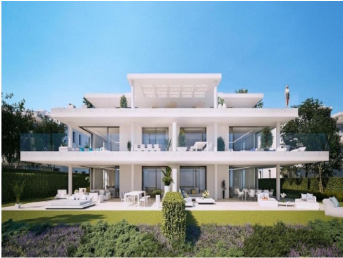
Front view of the complex