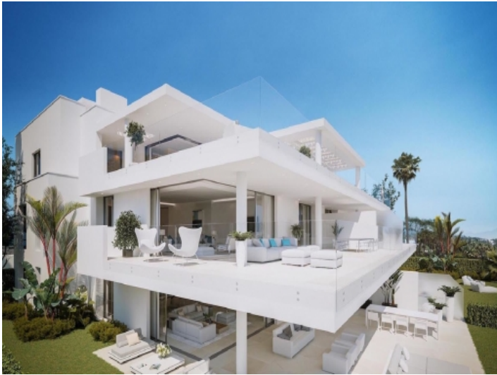
Side view of the apartment building