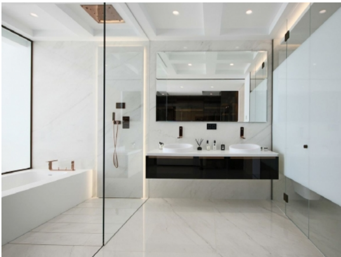
Elegant bathroom en suite