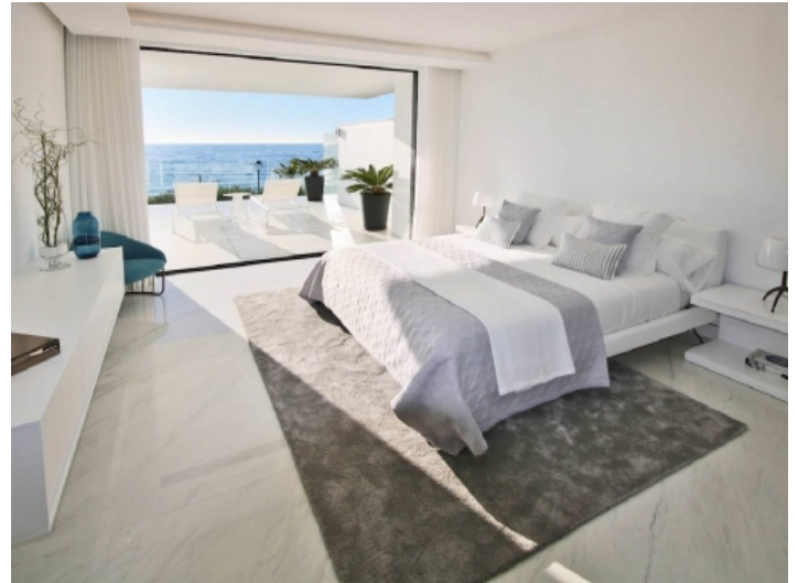
Comfortable sea view bedroom