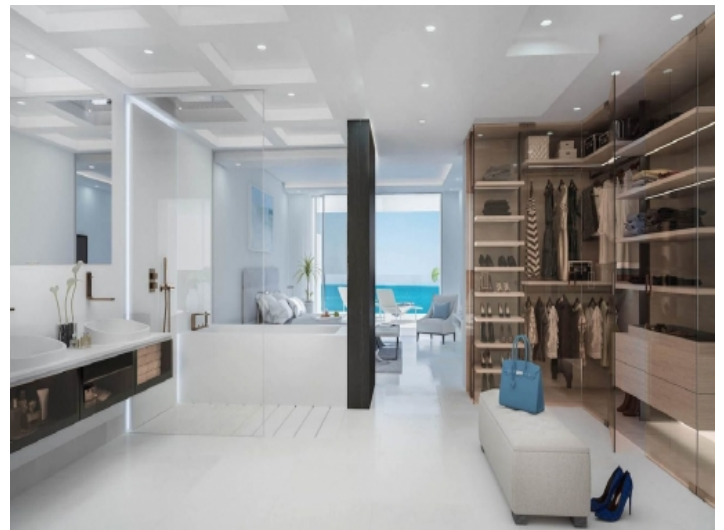
High-quality bedroom with bathroom and dressing room