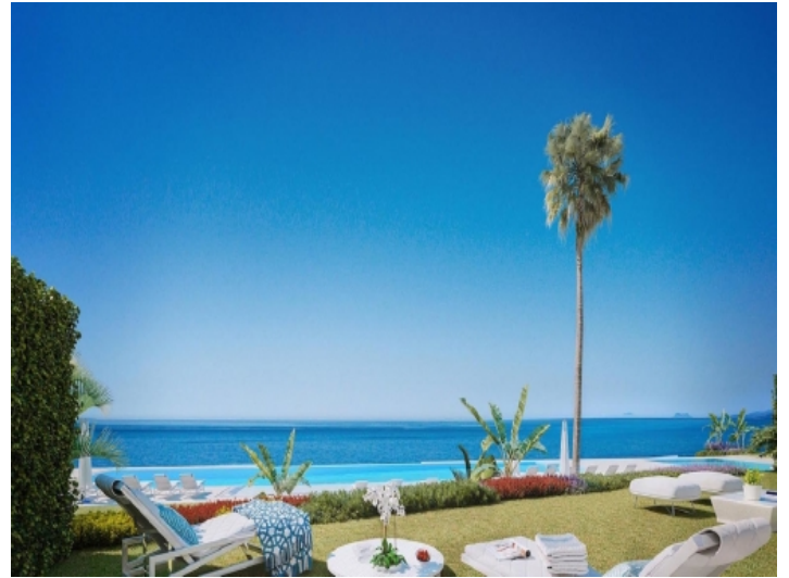
Pool in an excellent location in first sea line