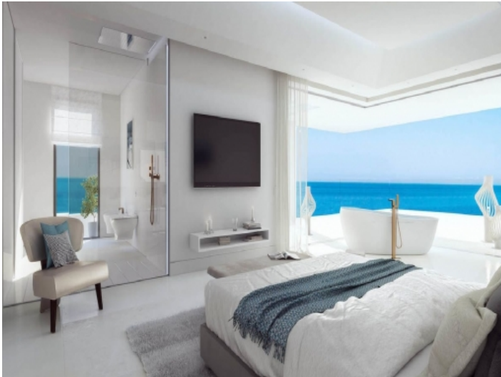
Luxurious bedroom with bathroom