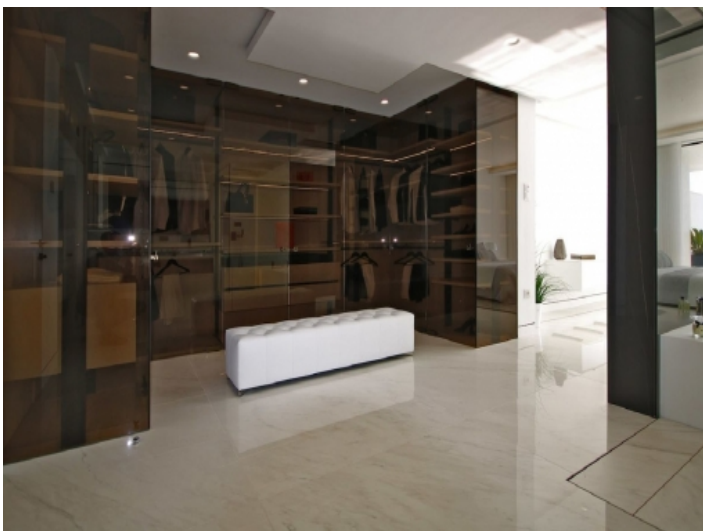
Large dressing room