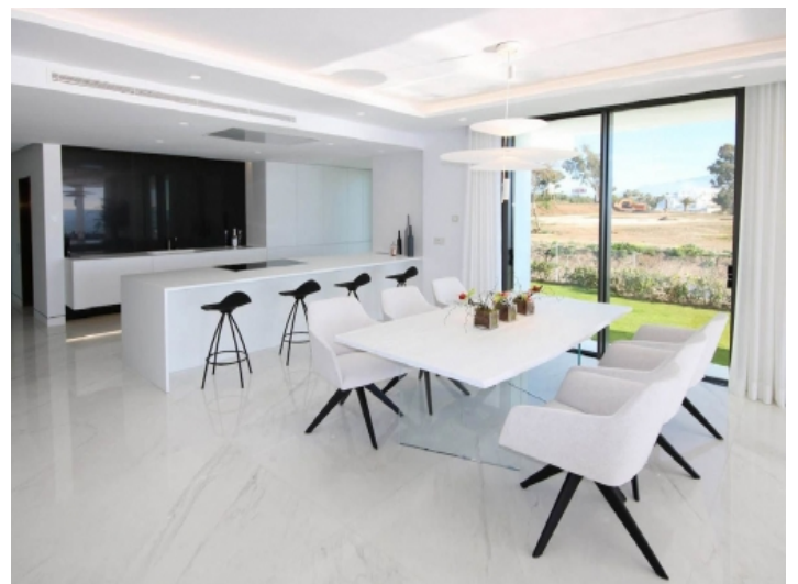
Bright dining area with open kitchen