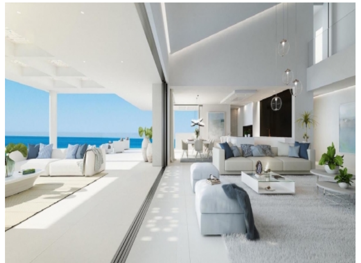
Modern living concept